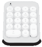
wireless desktop keypad