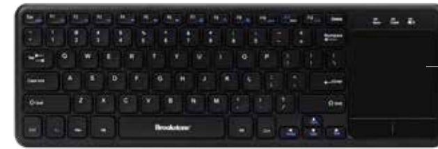
Wireless Trackpad Keyboard