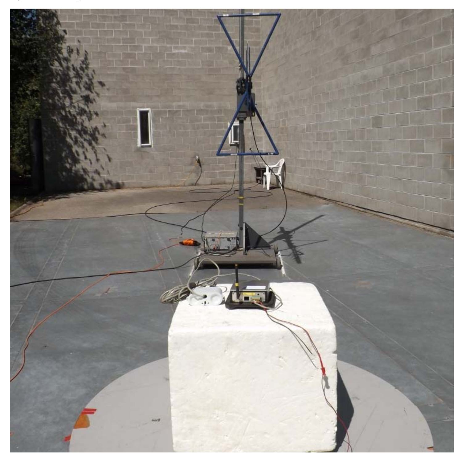
Figure E12.2 – Setup, Radiated Rx and Tx, 30 – 1000MHz