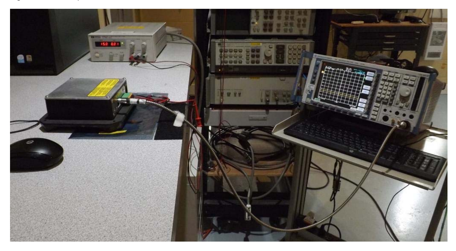
Figure E12.1 – Setup, Antenna Port Conducted