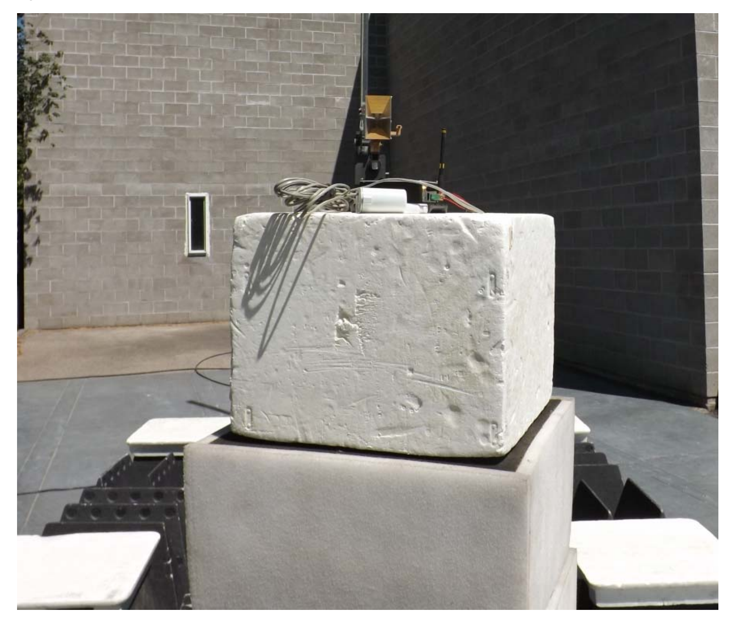
Figure E12.3 – Setup, Radiated Tx, 1 – 10GHz

Applicant:Bosspac Engineering and<br/>Technology Inc.FCC ID:ZI8EA206Test Report S/N:45461752-R1.0ISED ID9648A-EA206