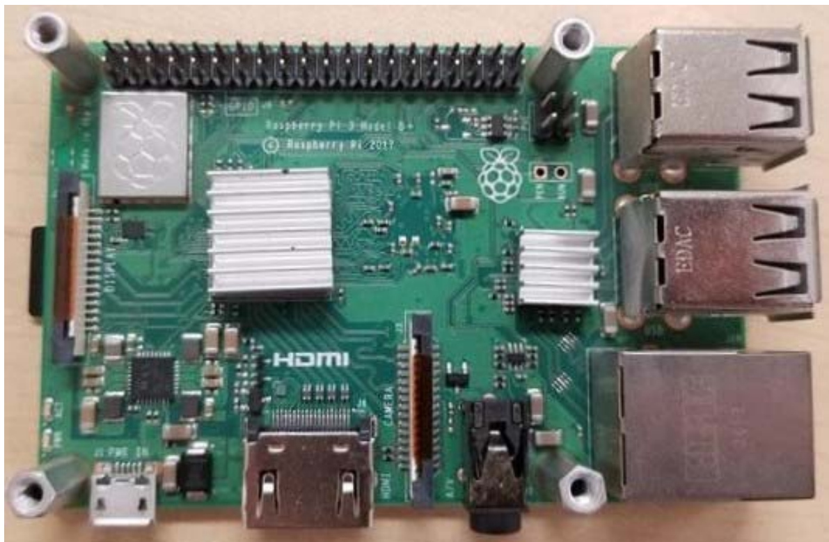
Figure E11B.1 – Internal, EA000406, PCB1 Top