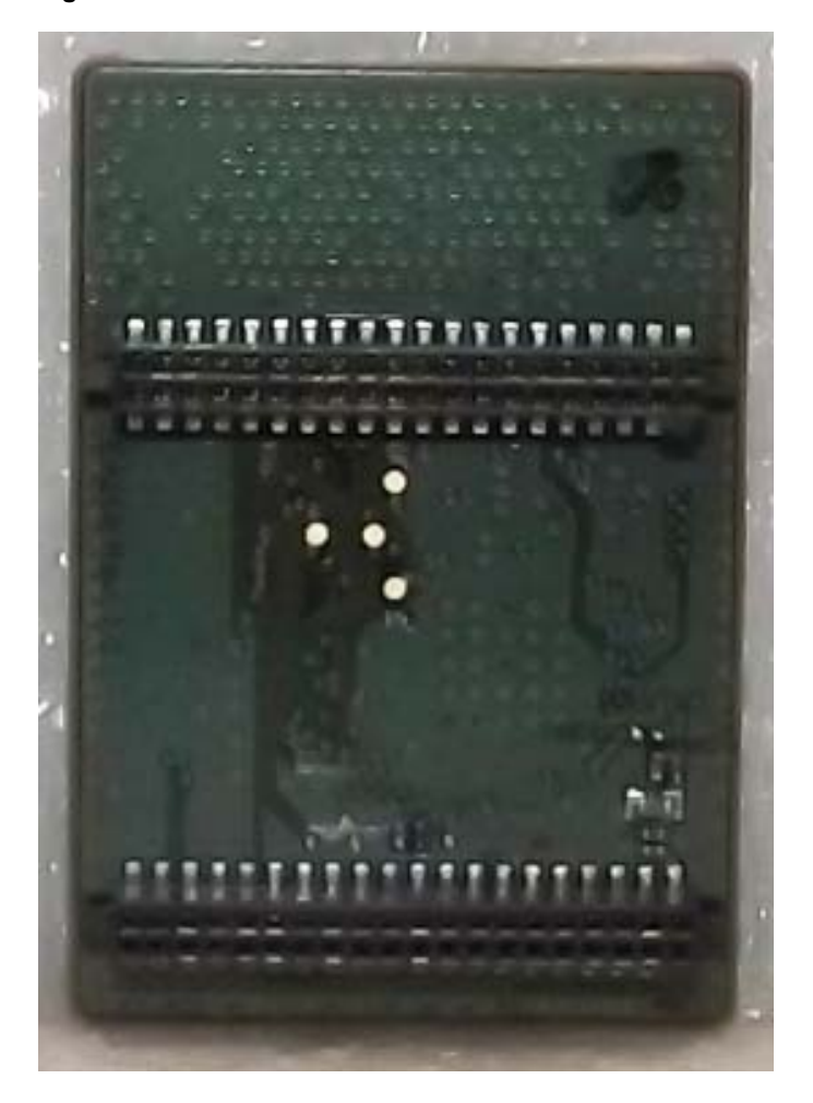
Figure E22.4 - Module Bottom