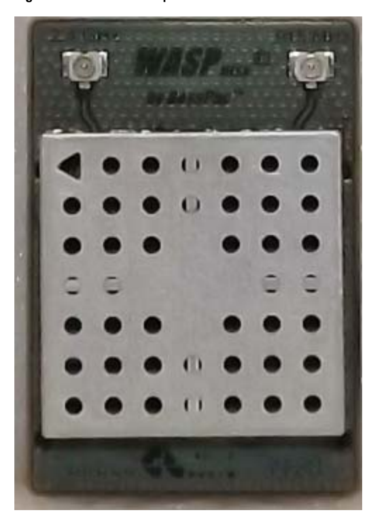
Figure E22.1 - Module Top