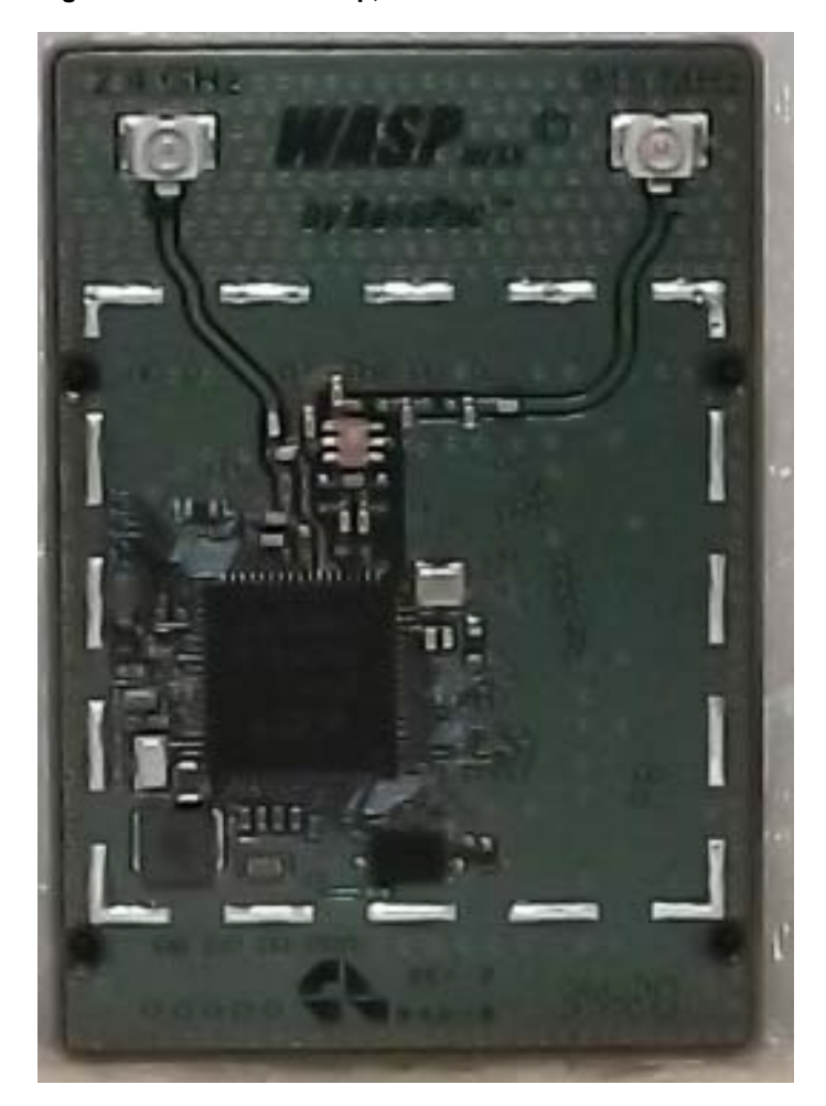
Figure E22.3 - Module Top, Shield Removed