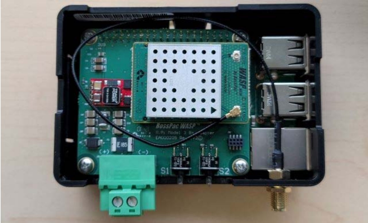
Figure E23.1 – Internal, Top Cover Removed