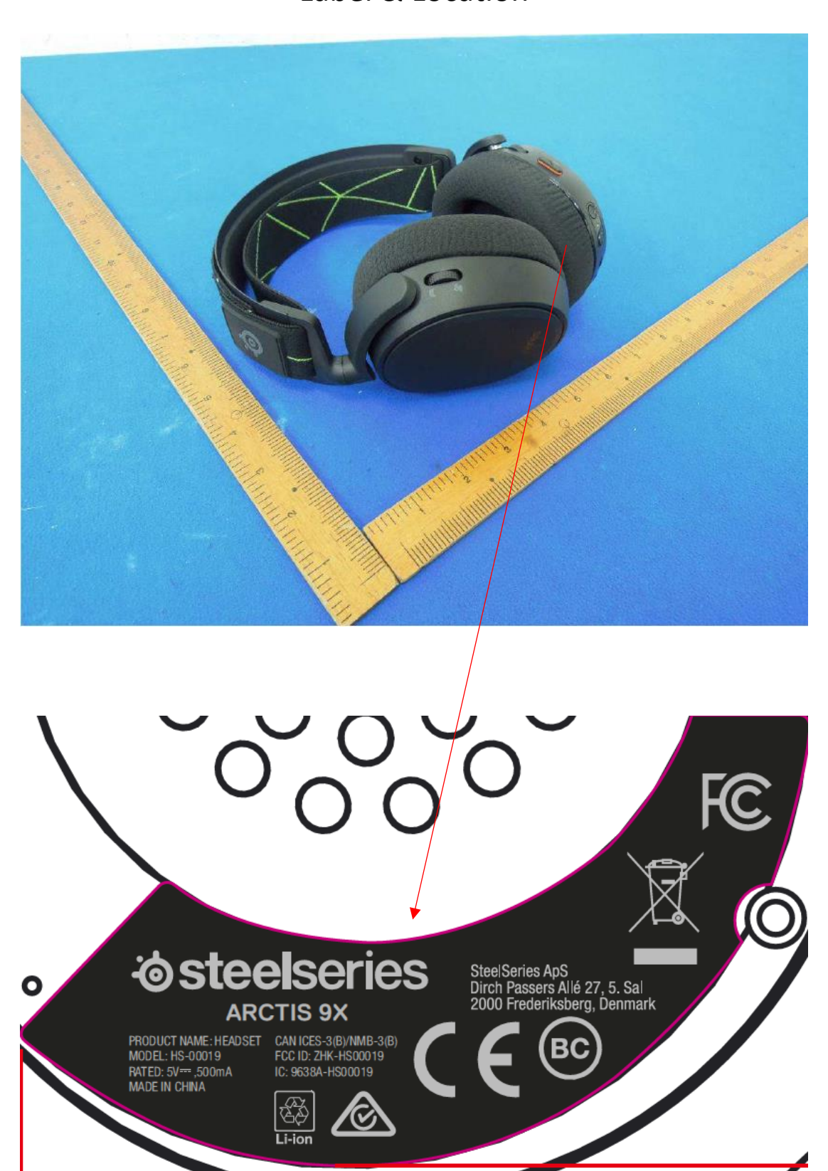
Label & Location