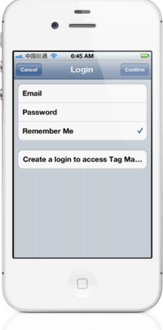
In the login screen, tap "Create a login to access Tag Manager" button.

Install our iPhone/iPad app from AppStore by searching "Wireless Tag List". Use the 12 digit serial numbers on your Ethernet Tag Manager to create a login. Keep the serial number in a safe place.