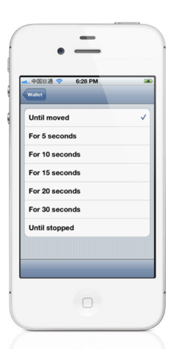
You can choose beep until moved, for 5,10,15,20,30 seconds, or indefinitely beep until stopped by the stop beep button at the bottom of the tag details screen.