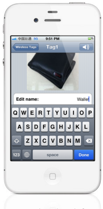
Tap at the right end of "Edit name:" row to edit the tag name, and tap "Done".

In the tag list screen, tap on the tag you want to edit to open the tag screen.