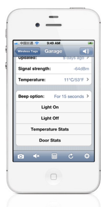
In the tag detail screen, scroll down and tap on "Door Stats" button.

Each tag automatically logs temperature and each time it is moved, opened or closed, so you can always check what happened while you were away.