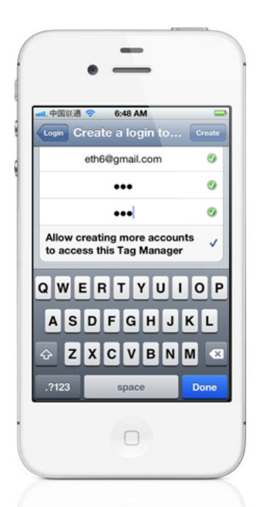
Tap "Create" button in the upper right corner to create an account. Uncheck "Allow creating more accounts..." unless you plan to create multiple logins to access the same Tag Manager.