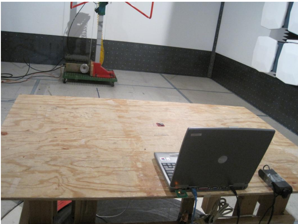
Radiated Emission (30 MHz – 1 GHz) – Back View