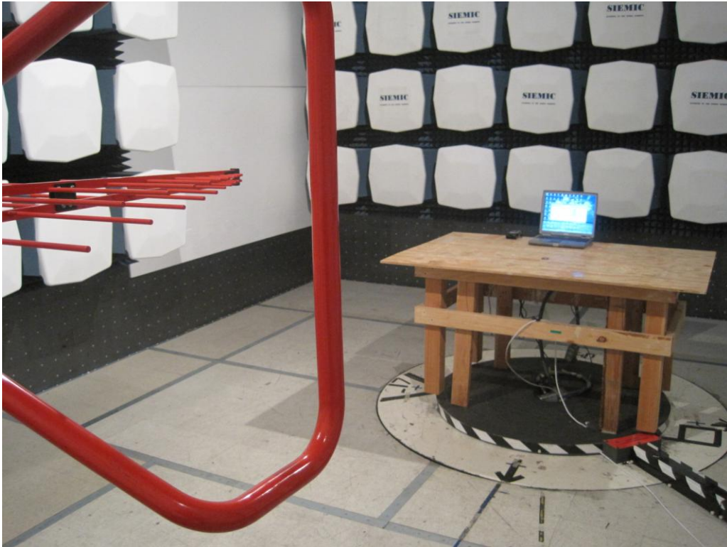
Radiated Emission (30 MHz – 1 GHz) – Front View