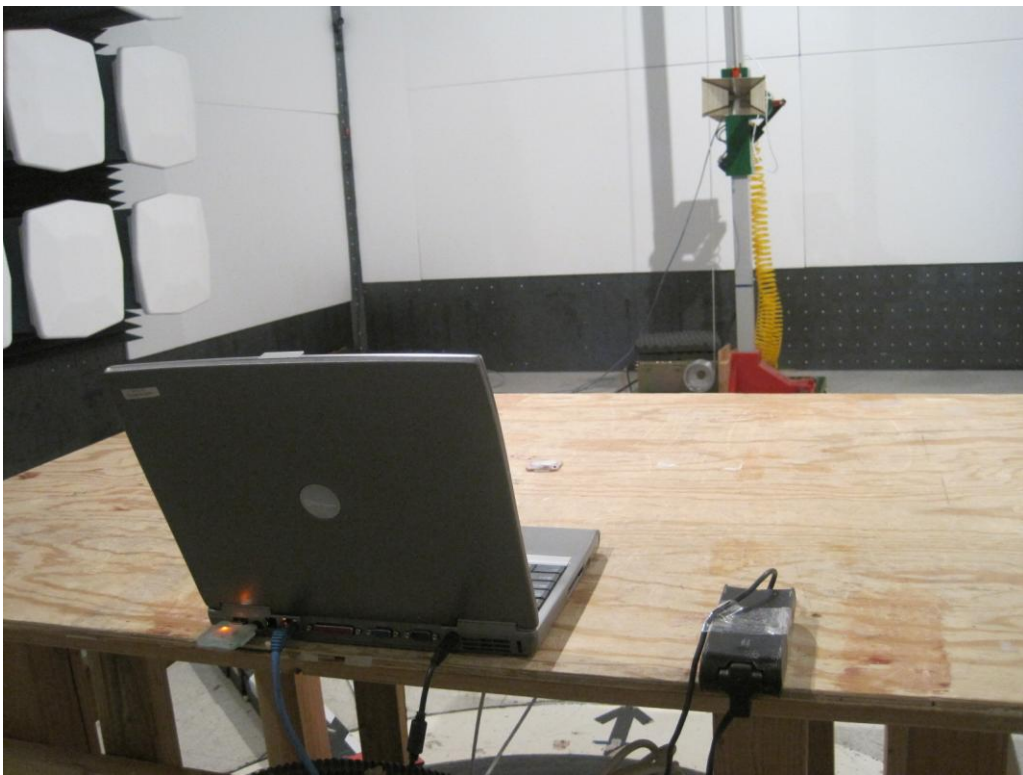
Radiated Emission (1 GHz – 5 GHz) – Back View