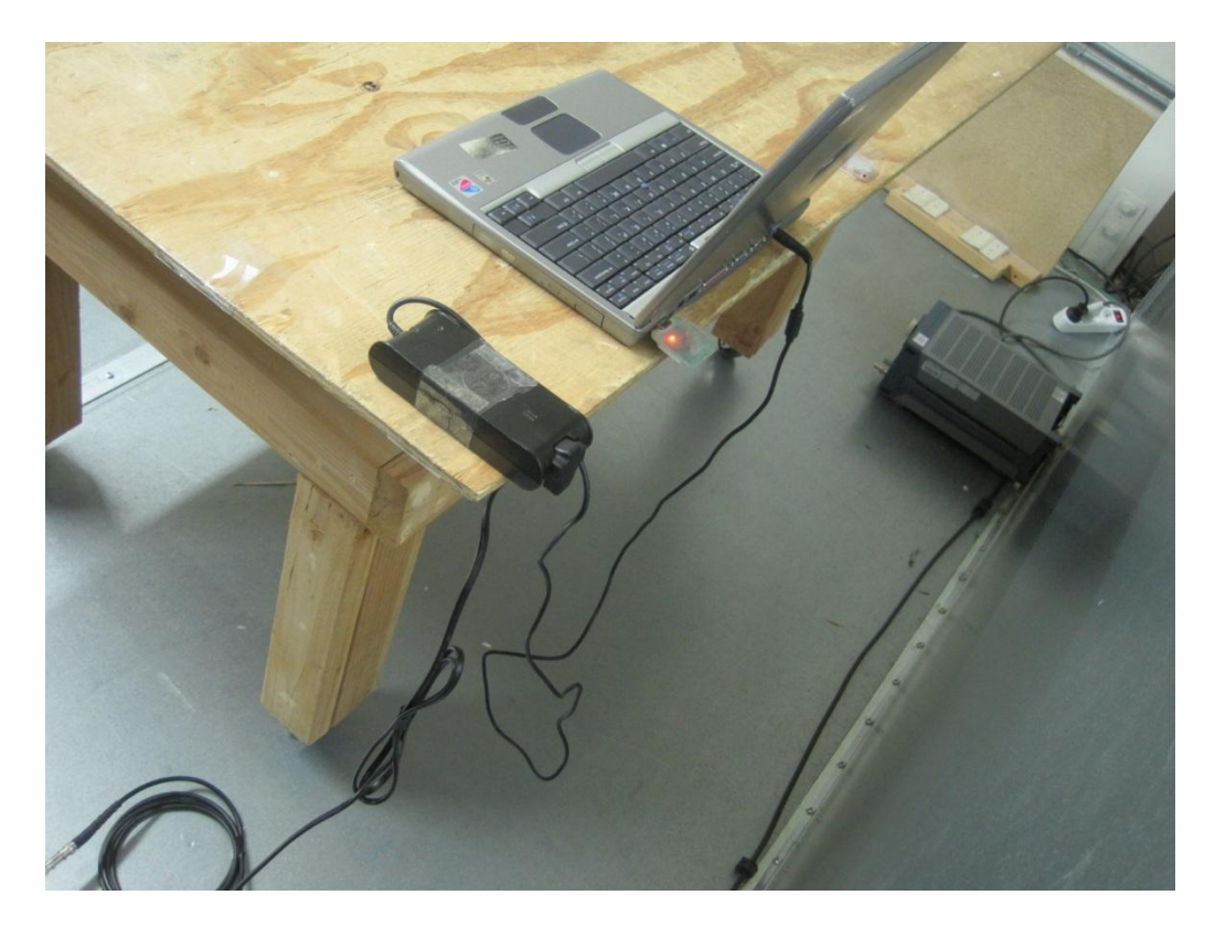
AC Line Conducted Emission - Back View