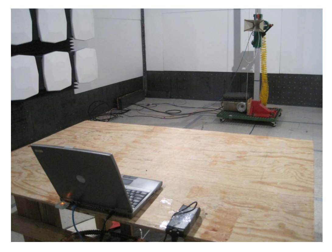
Radiated Emission (1GHz - 5GHz) – Back View