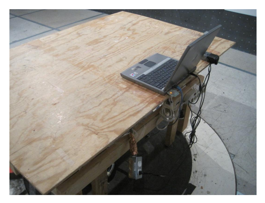
Radiated Emission (30 MHz – 1GHz) – Back View