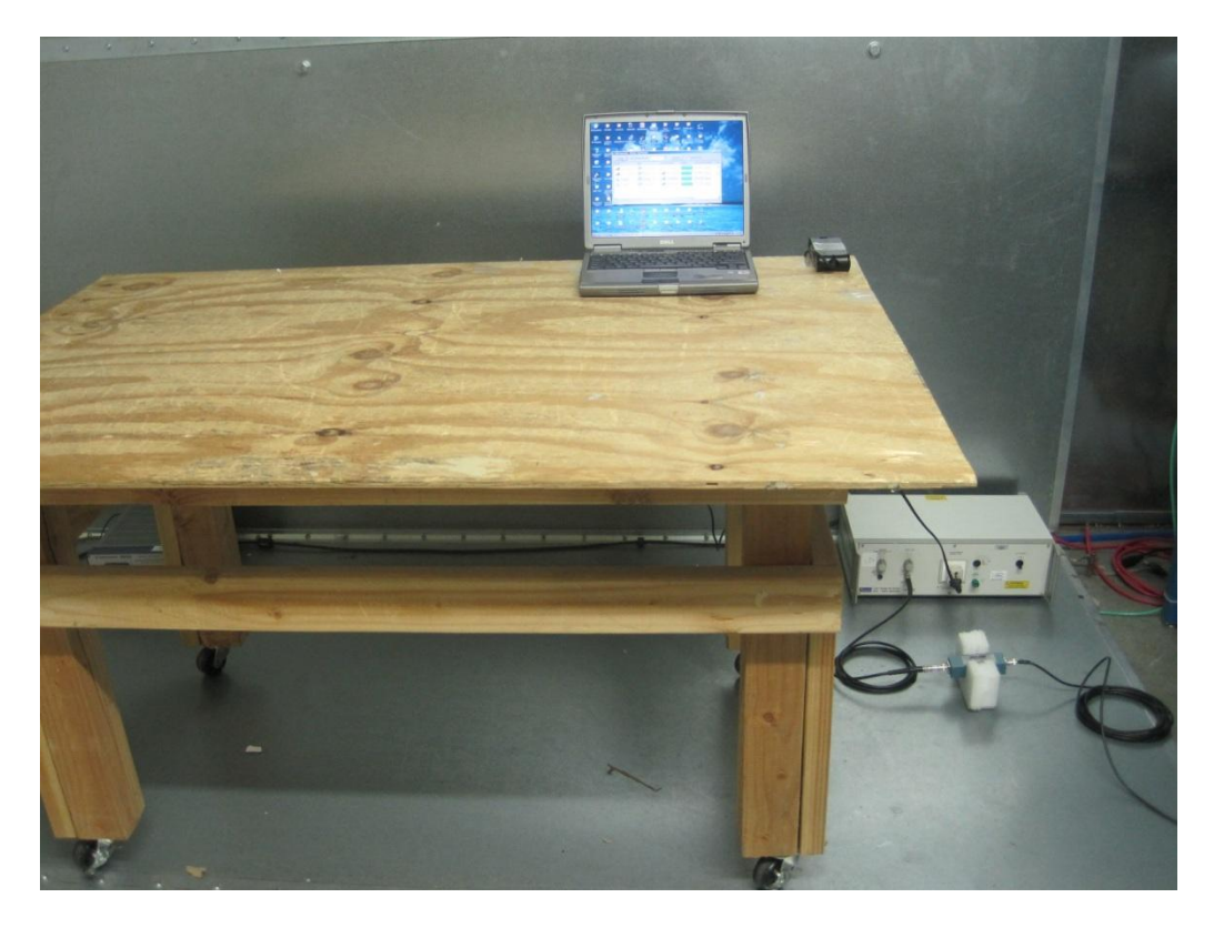
AC Line Conducted Emission - Front View