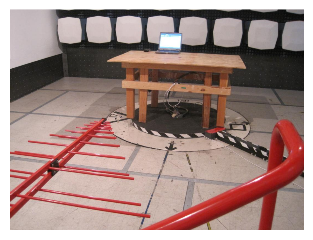
Radiated Emission (30 MHz – 1GHz) – Front View