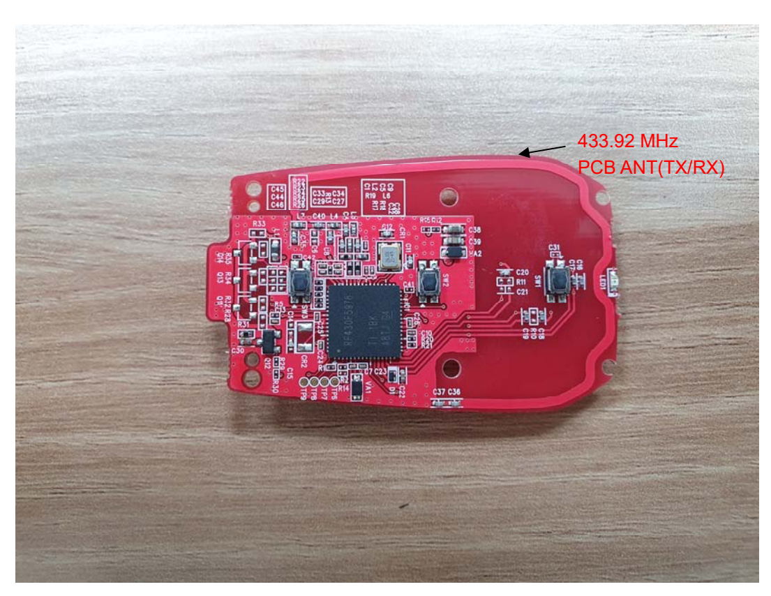
Main board - Front