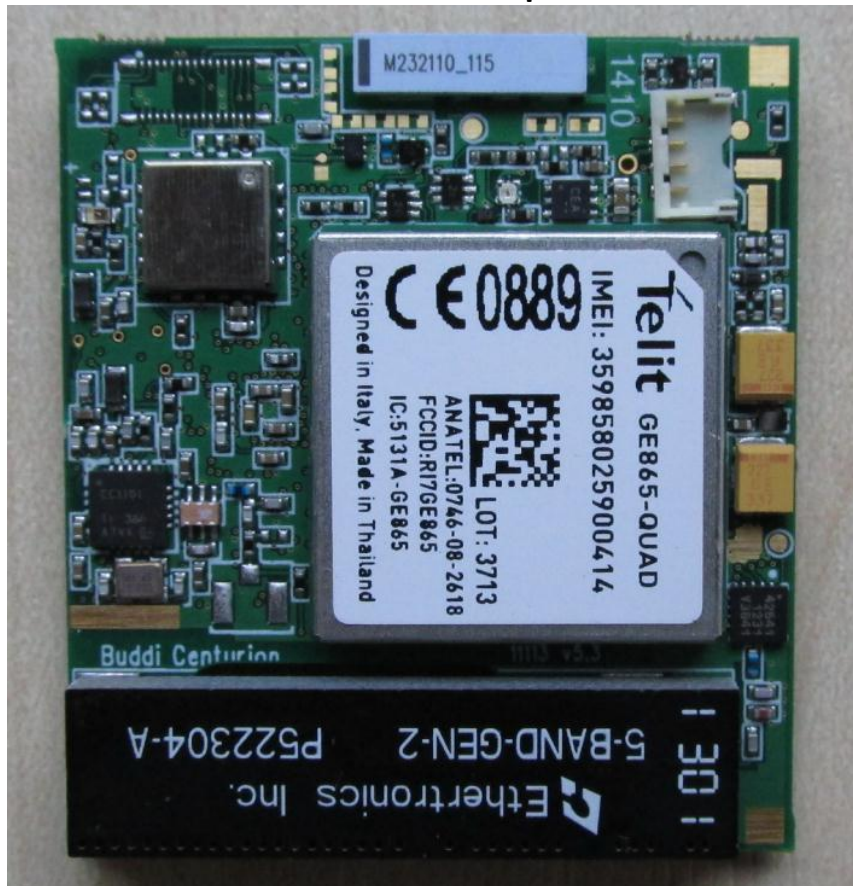
Figure 1: Smart TAG PCB, top