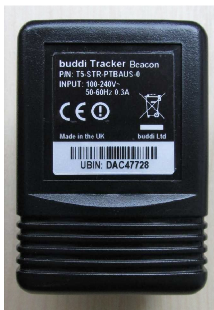
Figure 1: RF Beacon label position