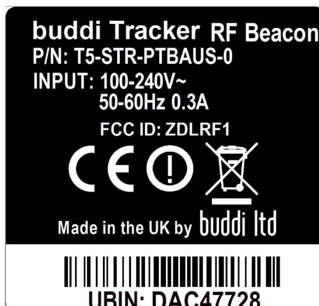
Figure 2: RF Beacon label artwork