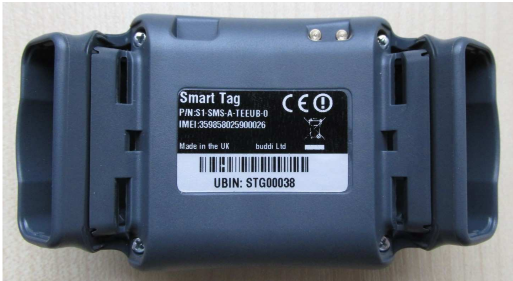
Figure 5: Smart TAG label position