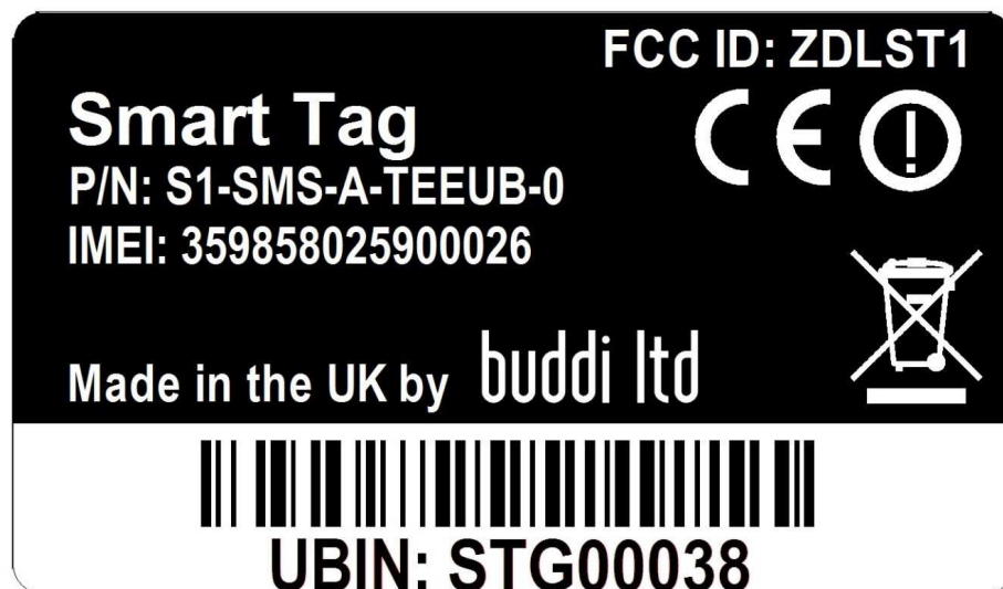
Figure 6: Smart TAG label artwork