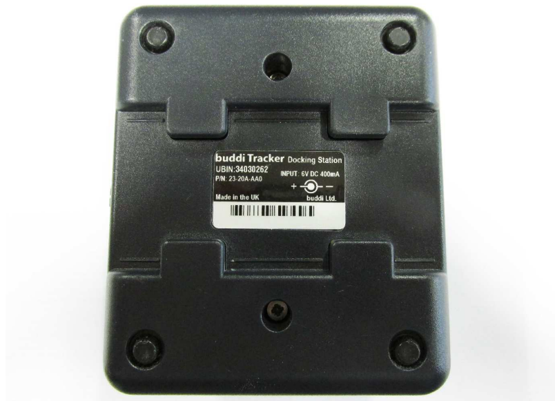
Figure 9: Dock label position