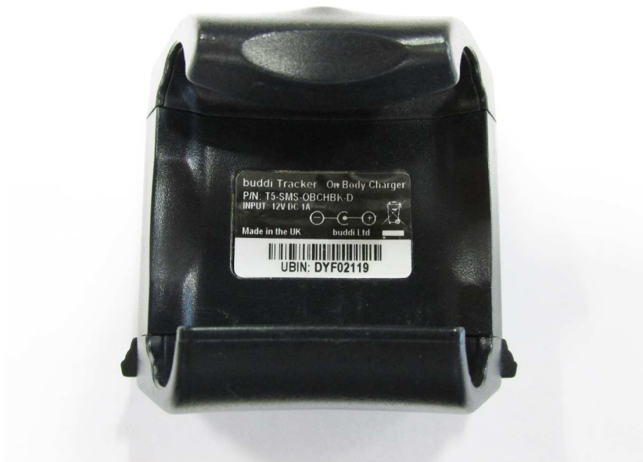
Figure 7: On-Body Charger label position