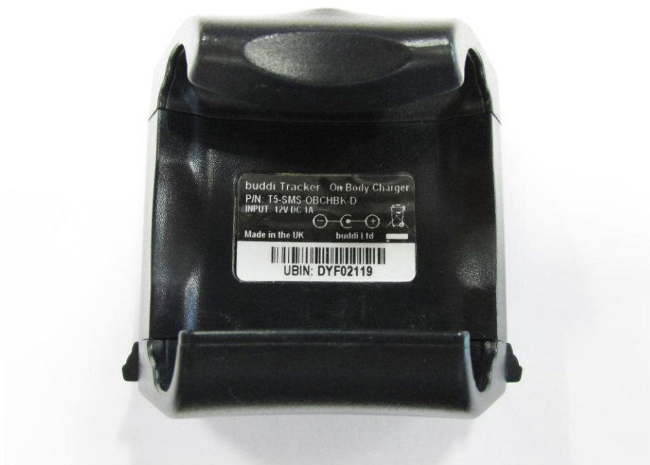
Figure 7: On-Body Charger label position