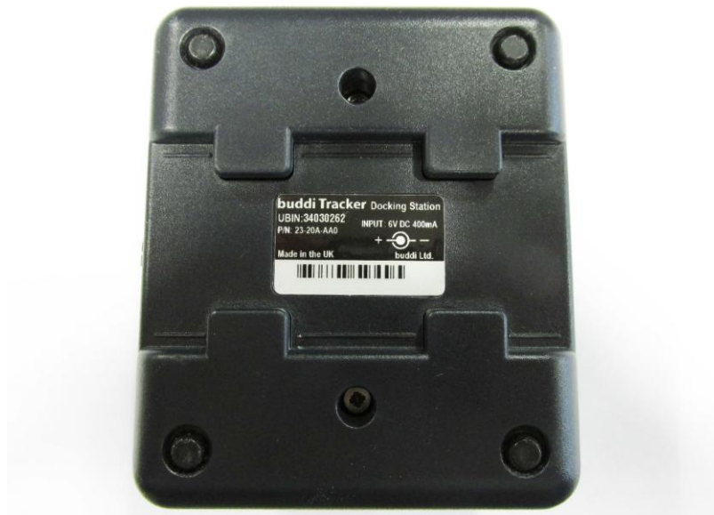
Figure 9: Dock label position