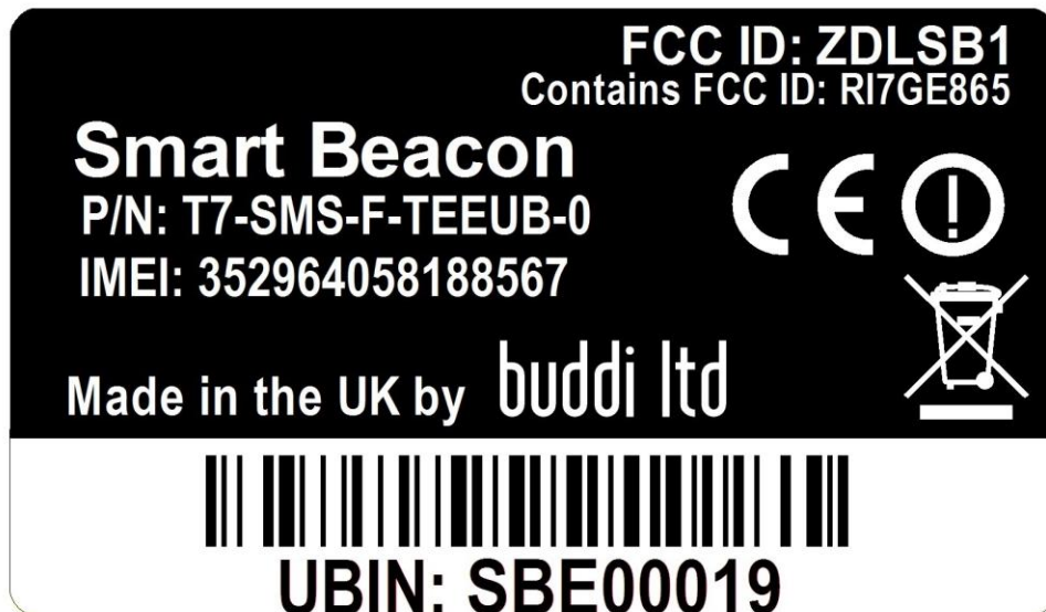
Figure 4: Smart Beacon label artwork