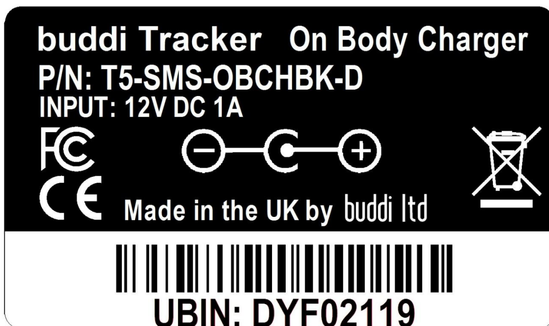
Figure 8: On-Body Charger label artwork