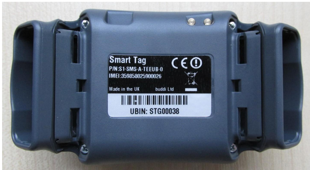
Figure 5: Smart TAG label position