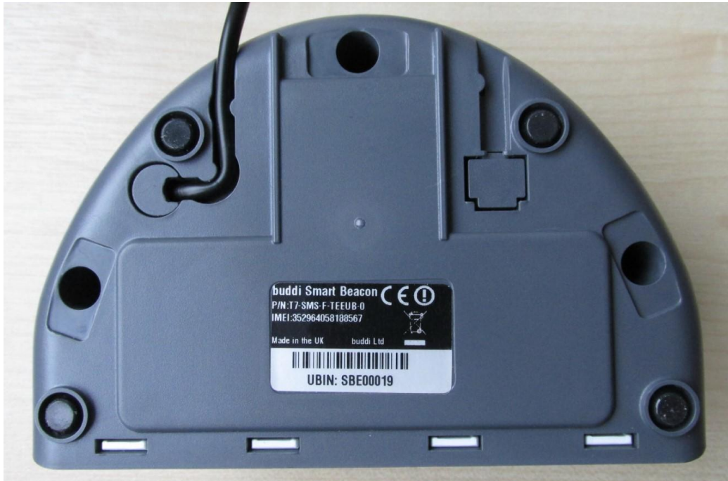
Figure 3: Smart Beacon label position