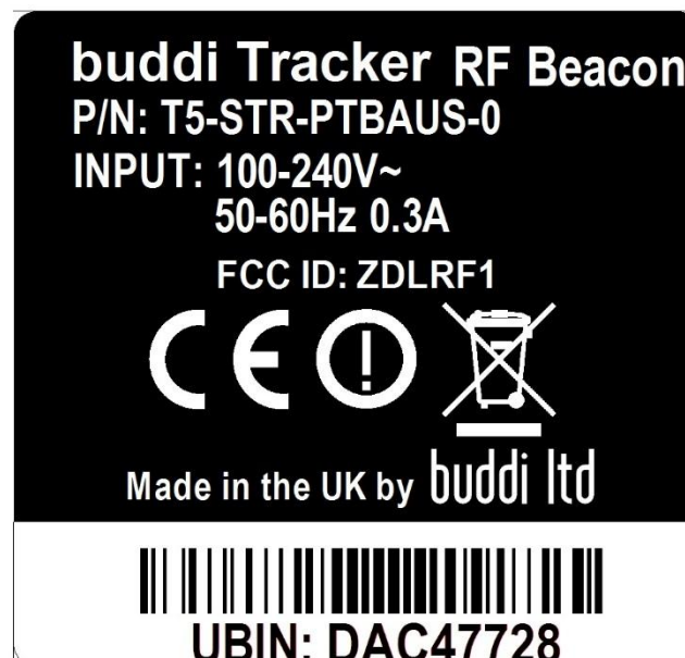
Figure 2: RF Beacon label artwork