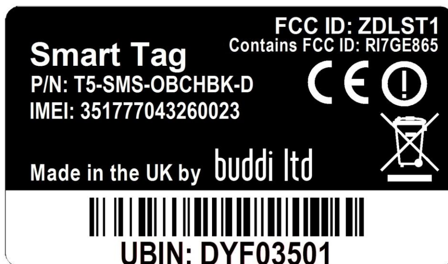
Figure 6: Smart TAG label artwork