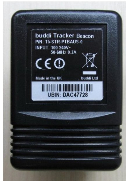
Figure 1: RF Beacon label position