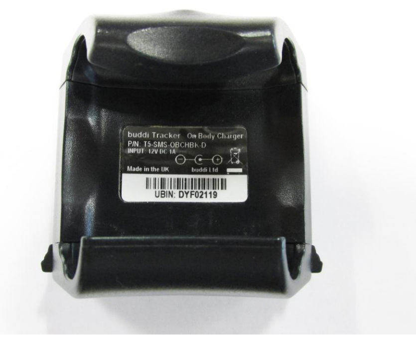
Figure 7: On-Body Charger label position