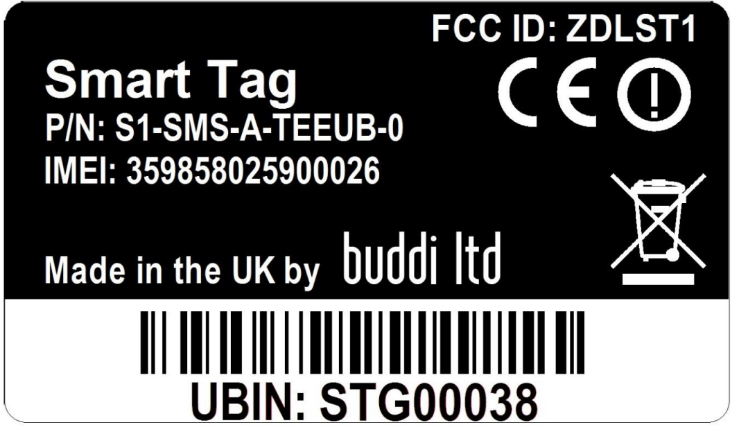
Figure 6: Smart TAG label artwork