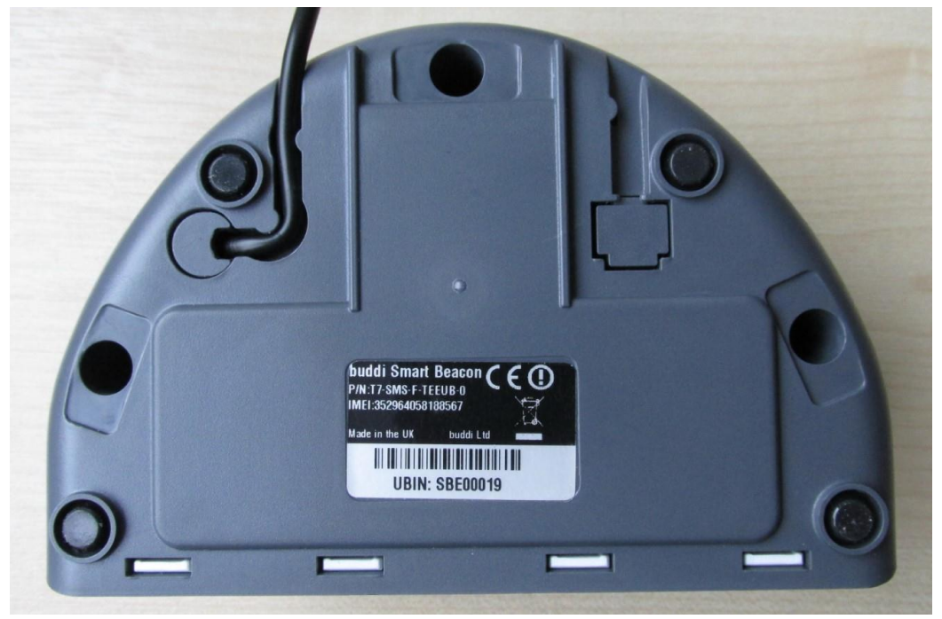
Figure 3: Smart Beacon label position