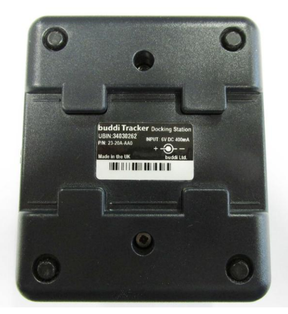
Figure 9: Dock label position