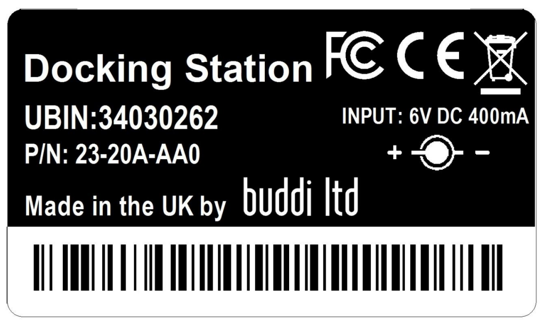
Figure 10: Dock label artwork