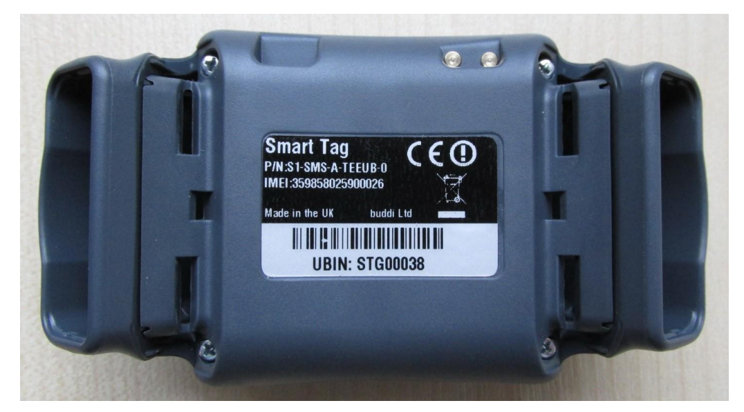
Figure 5: Smart TAG label position