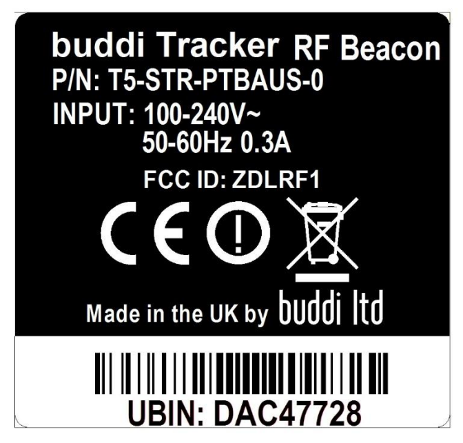
Figure 2: RF Beacon label artwork