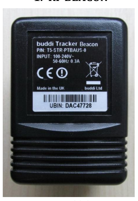
Figure 1: RF Beacon label position