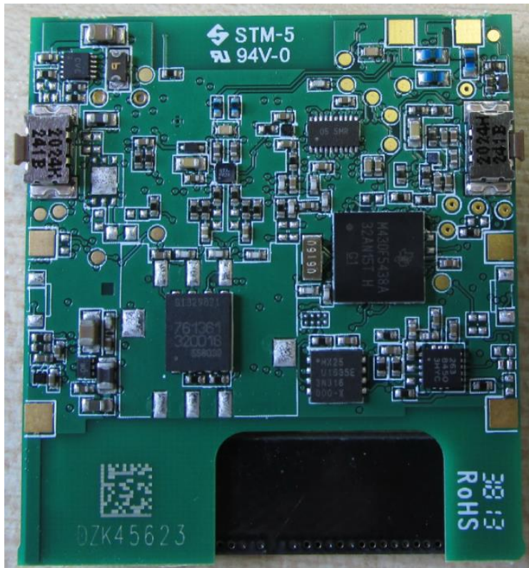
Figure 4: PCB bottom