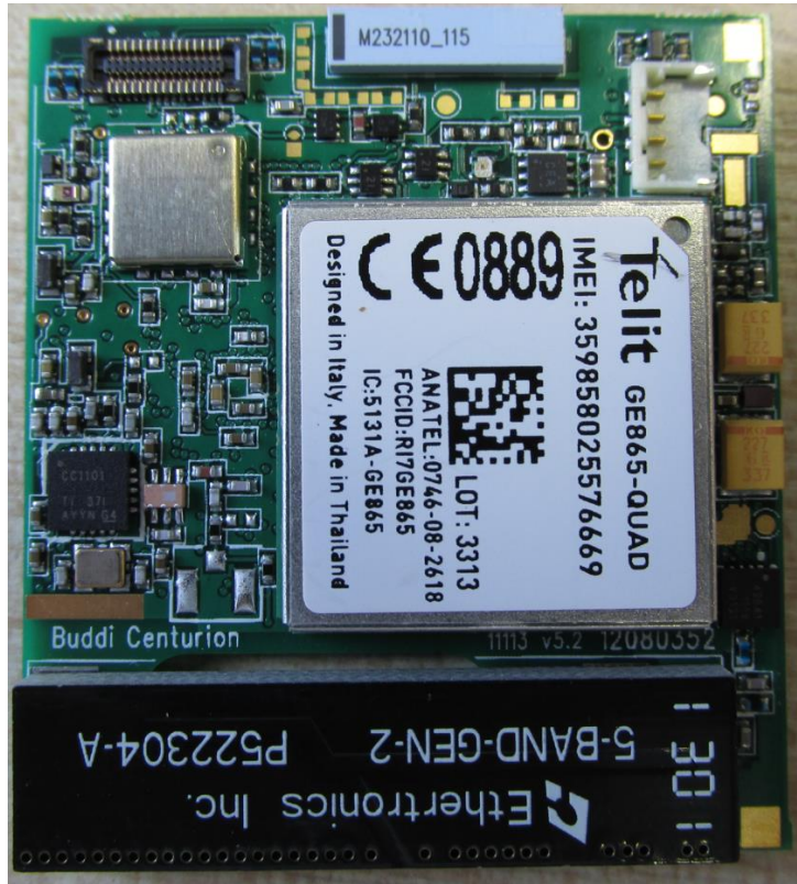
Figure 3: PCB top