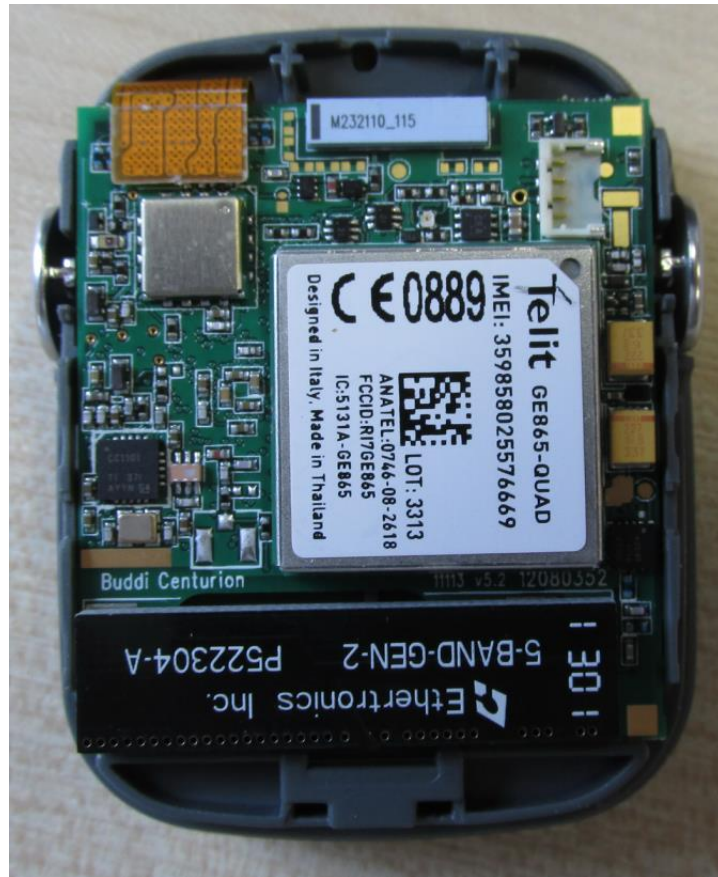
Figure 1: Clip inside, top