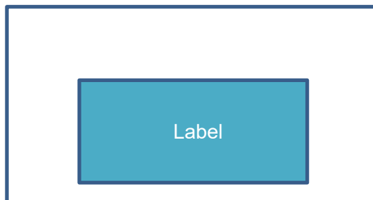
Figure 1 – Label position, on top of Module