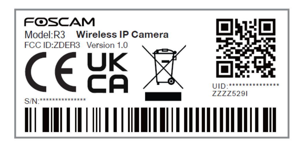
FCC ID Label Location Information