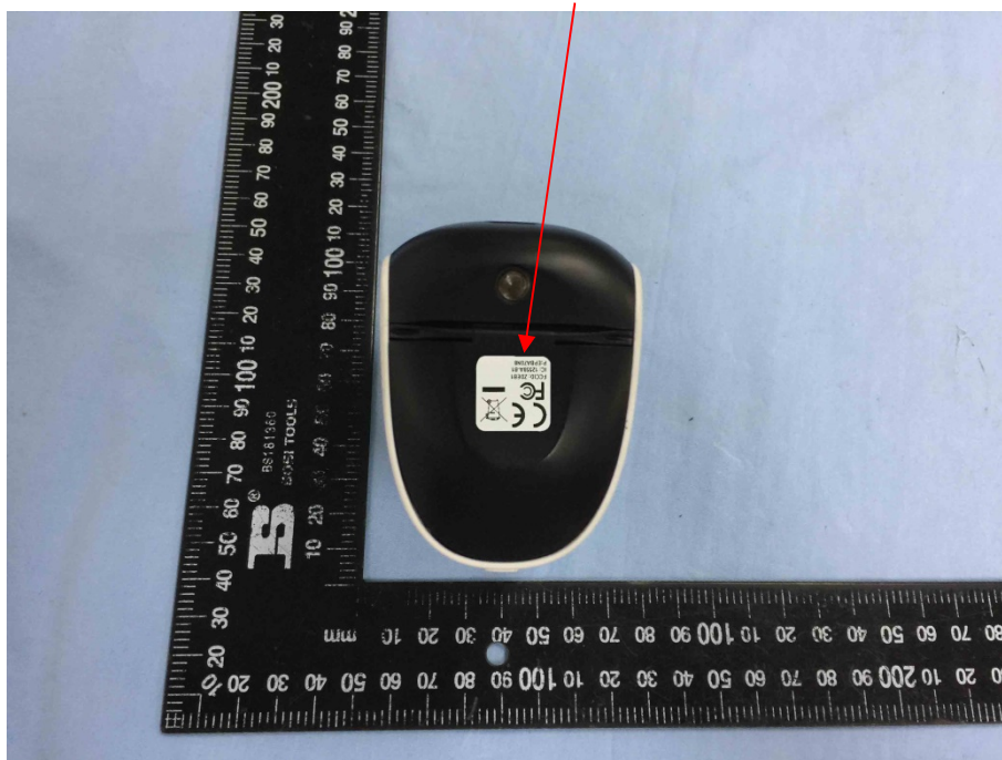
FCC Label Location