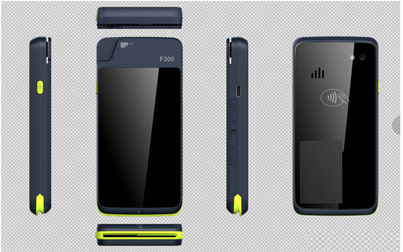
Figure 1 F300 appearance figure