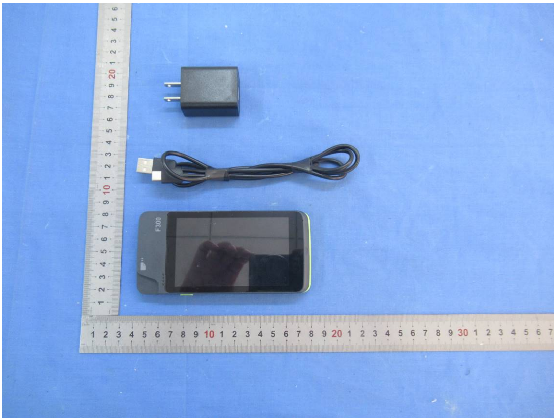
EXHIBIT B - EUT EXTERNAL PHOTOGRAPHS