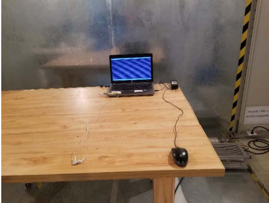
Conducted Emissions - Rear Side