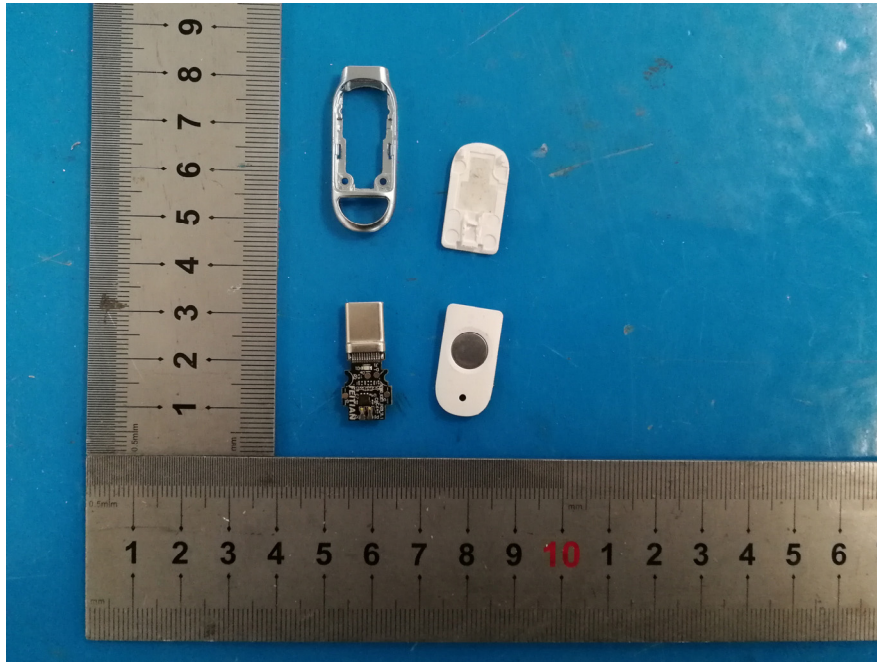
EUT – PCB Top View