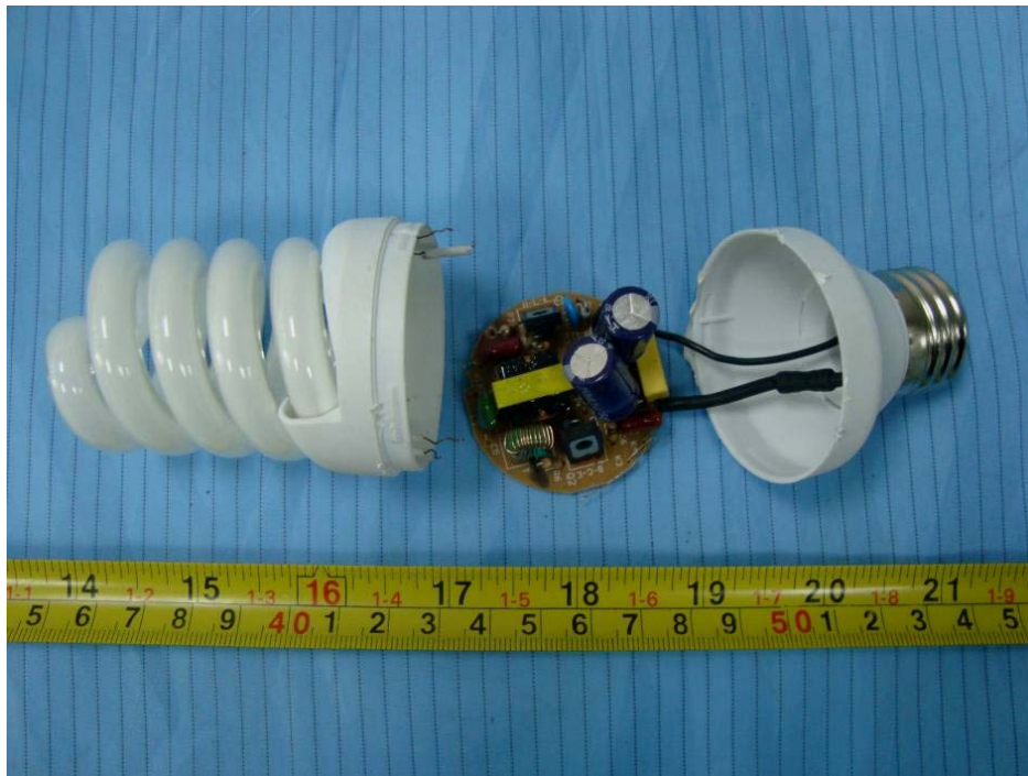
EUT – Mainboard Top View