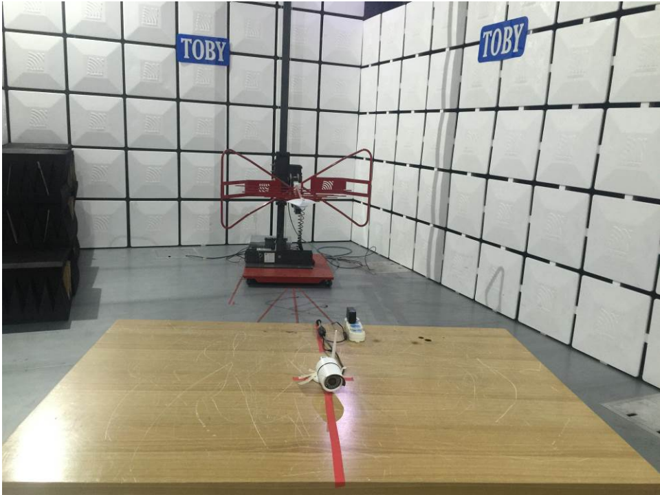
Radiated emission – above 1GHz