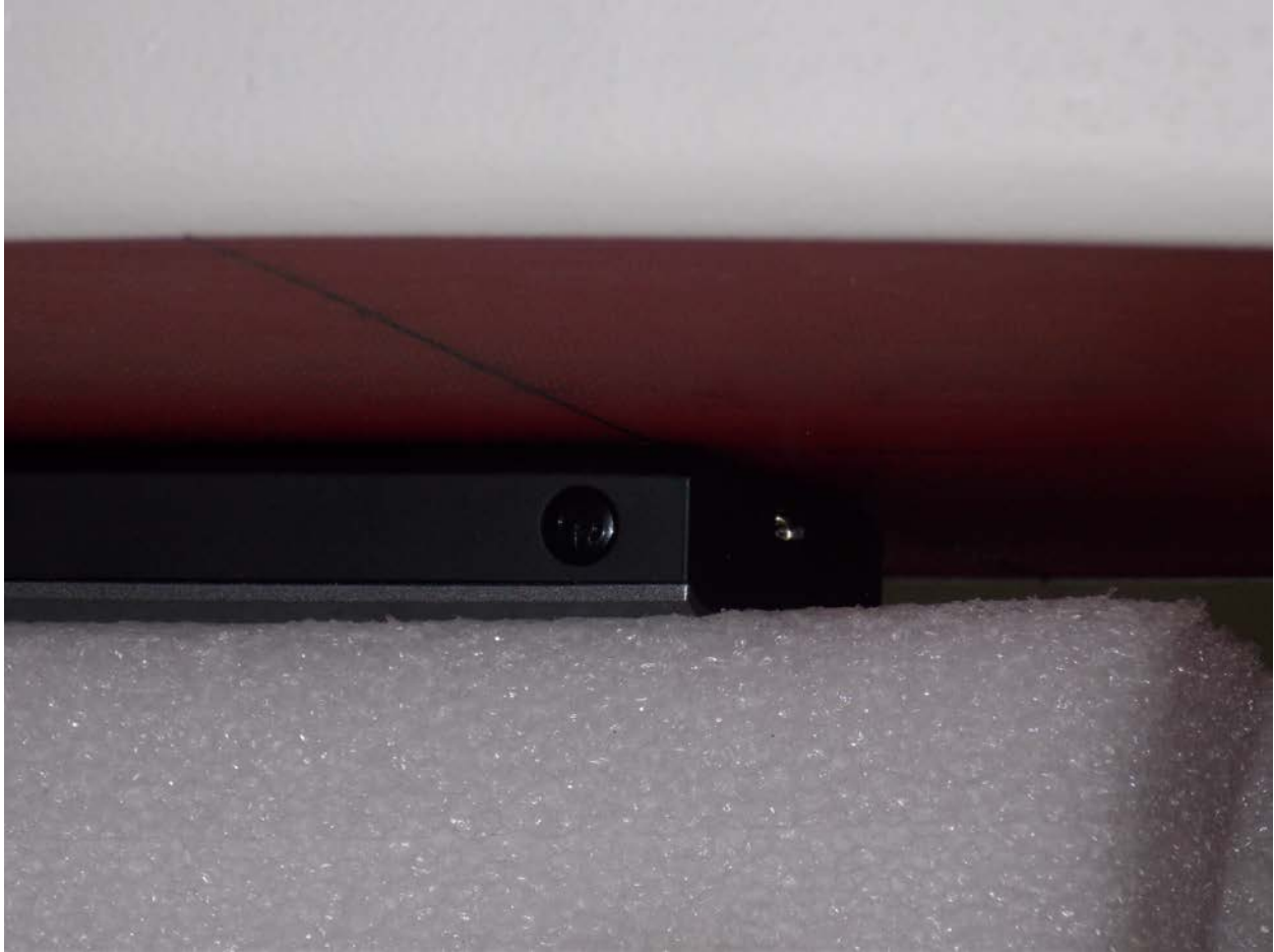
Test Position Side B 0 mm Gap