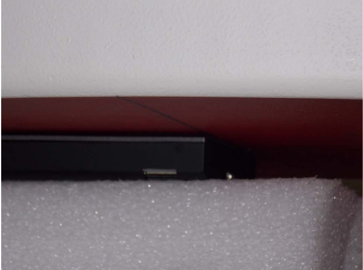
Test Position Side A 0 mm Gap