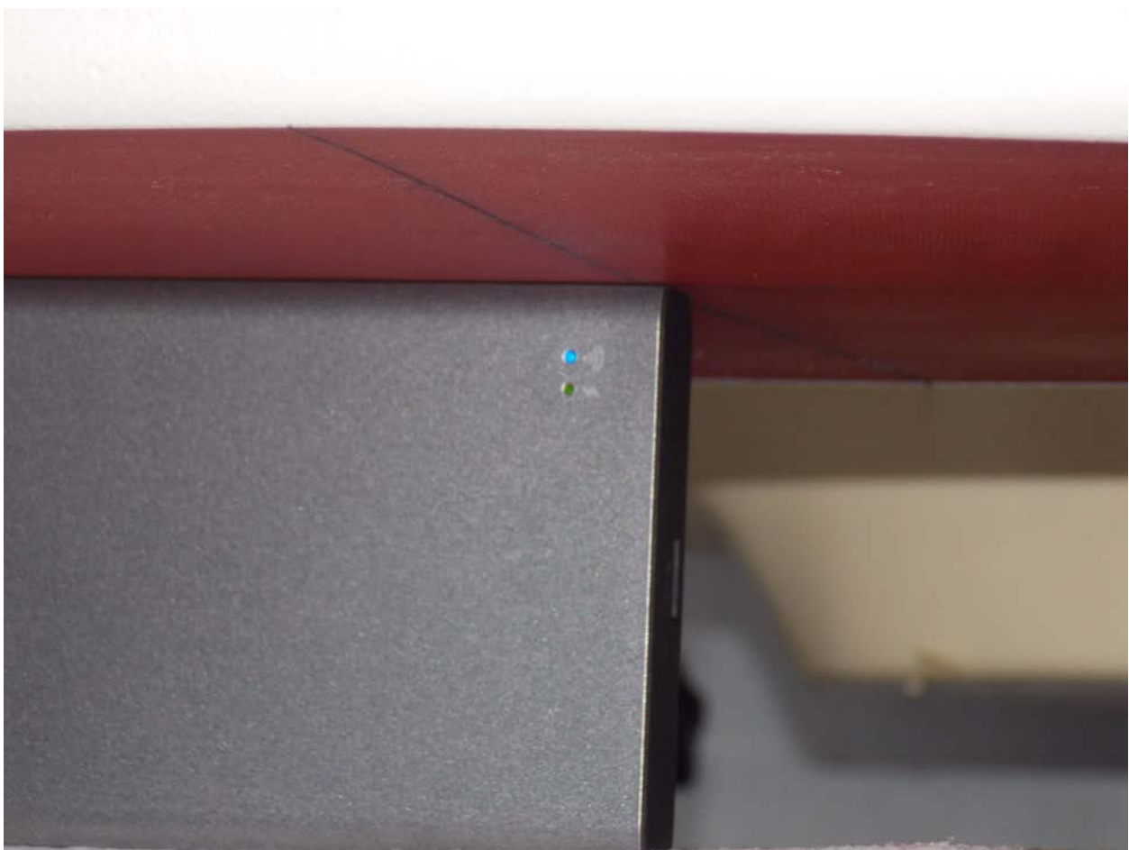
Test Position Side C 0 mm Gap