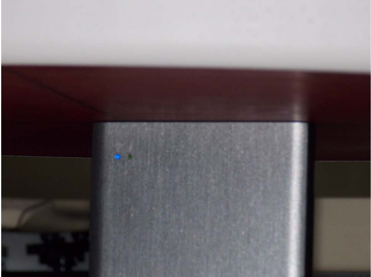
Test Position Side D 0 mm Gap