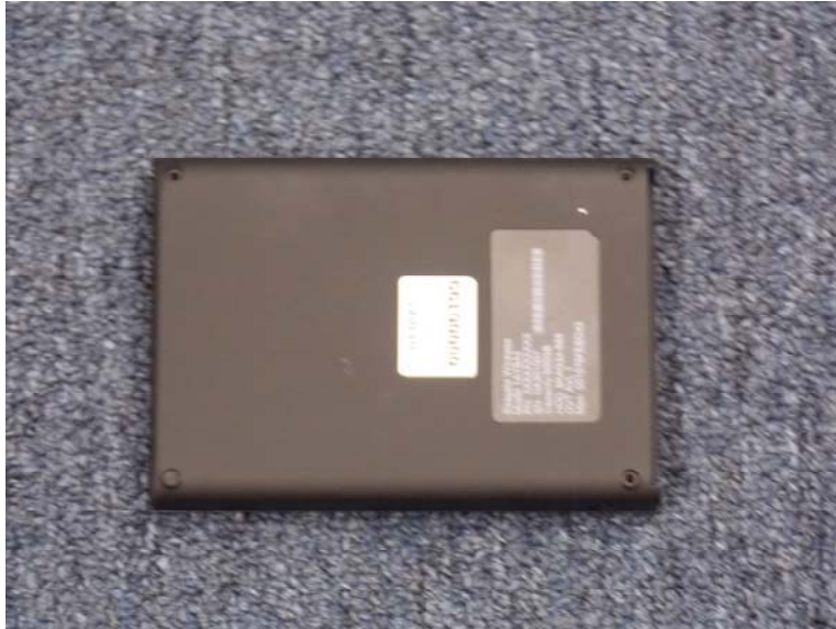
Back of Device