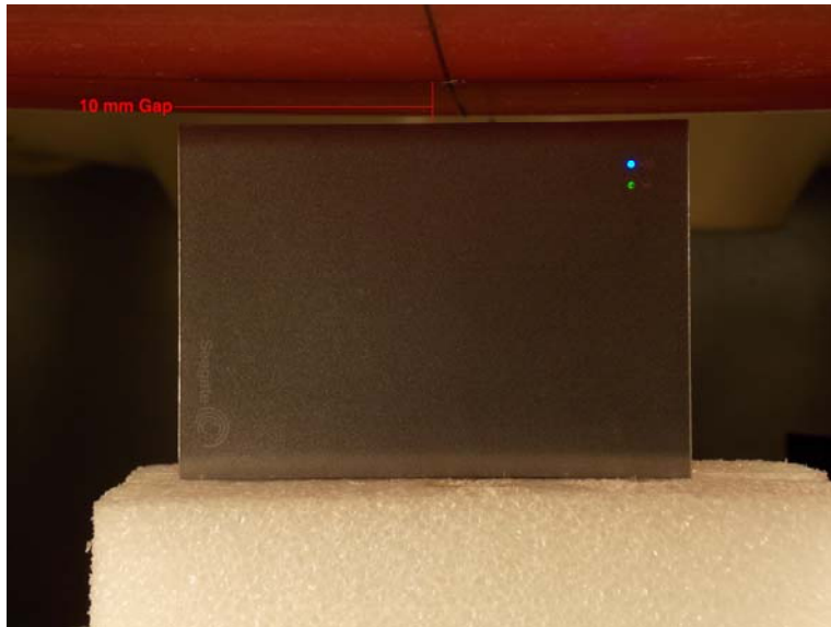
Test Position Side C 10 mm Gap