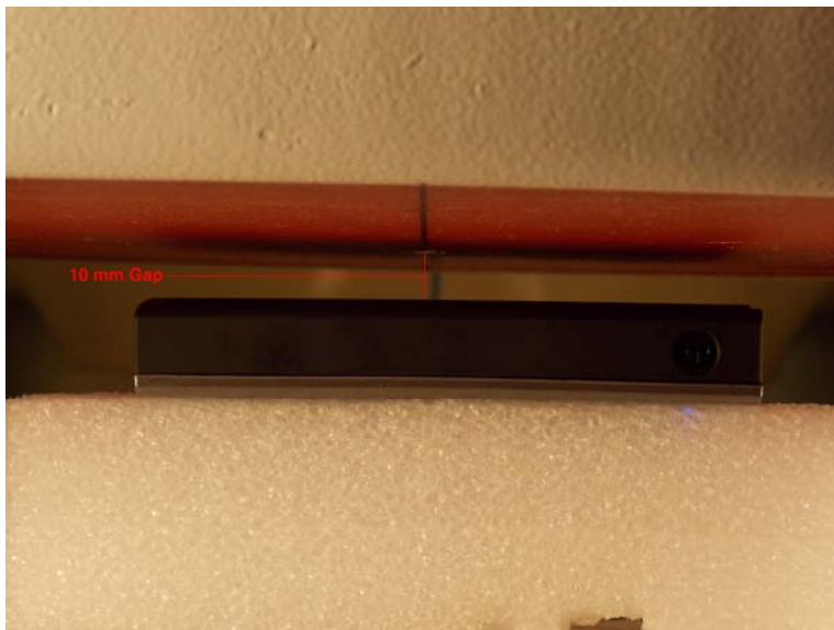
Test Position Side B 10 mm Gap