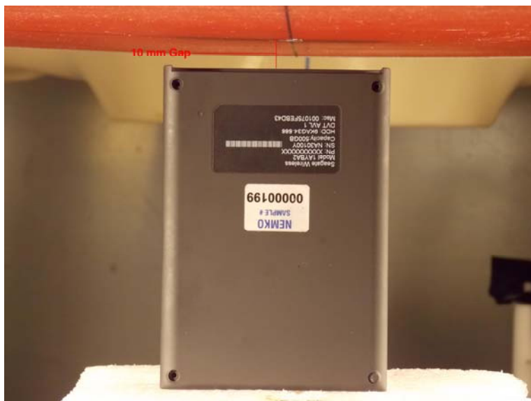
Test Position Side D 10 mm Gap