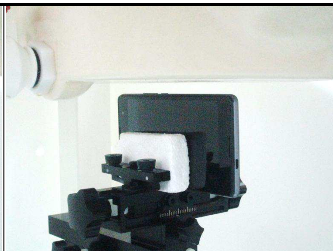
Right Side of EUT with 1.0 cm Gap