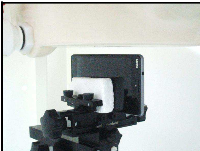
Left Side of EUT with 1.0 cm Gap