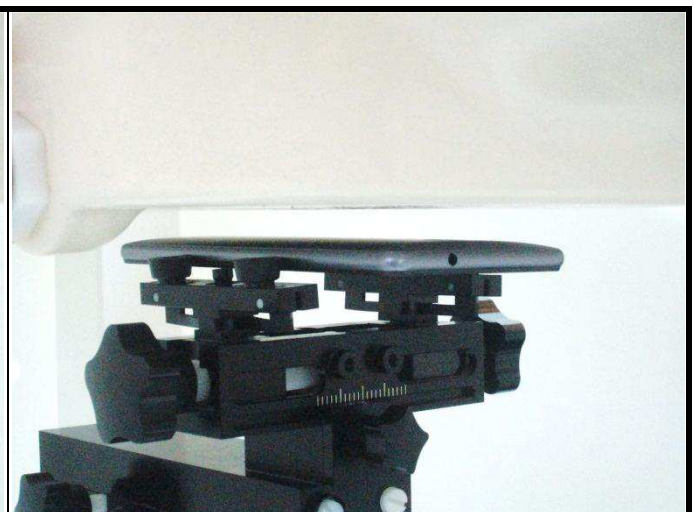
Rear Face of EUT with 1.0 cm Gap