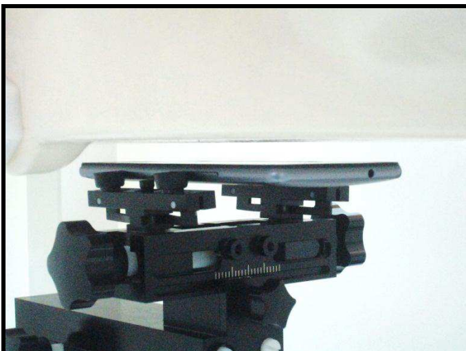
Front Face of EUT with 1.0 cm Gap