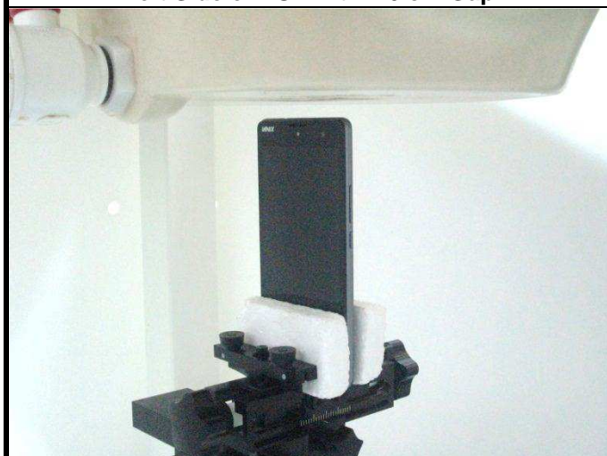
Top Side of EUT with 1.0 cm Gap