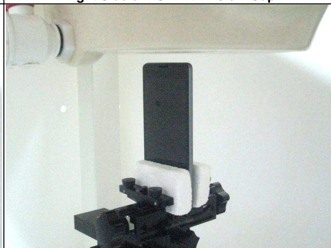
Bottom Side of EUT with 1.0 cm Gap