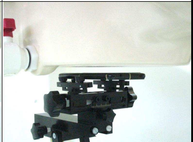
Rear Face of EUT with 1.0 cm Gap