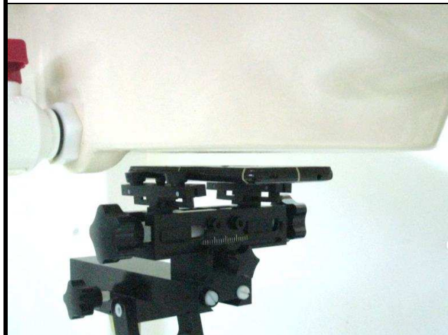
Front Face of EUT with 1.0 cm Gap