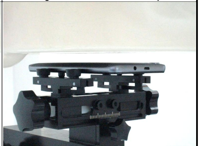
Rear Face of EUT with 1.0 cm Gap