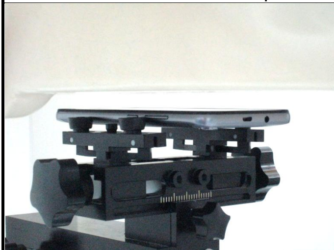
Front Face of EUT with 1.0 cm Gap