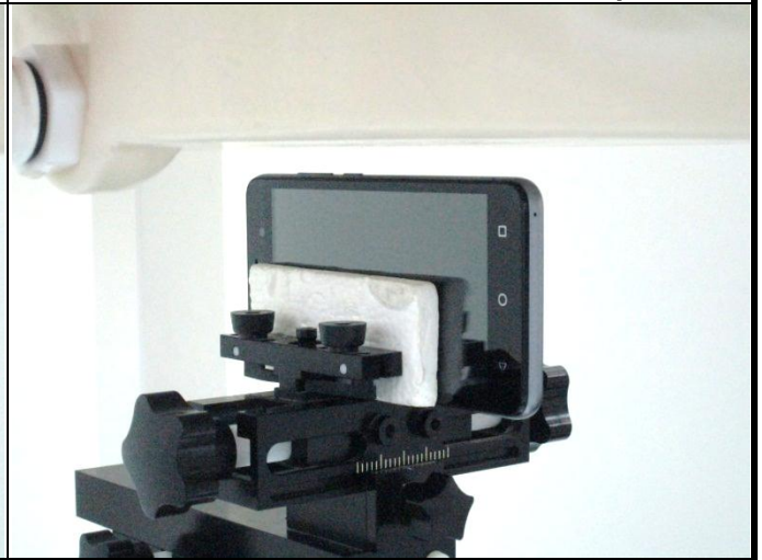
Right Side of EUT with 1.0 cm Gap