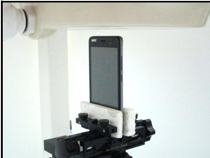
Top Side of EUT with 1.0 cm Gap