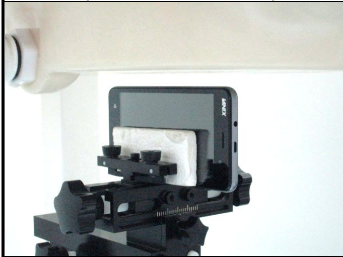
Left Side of EUT with 1.0 cm Gap