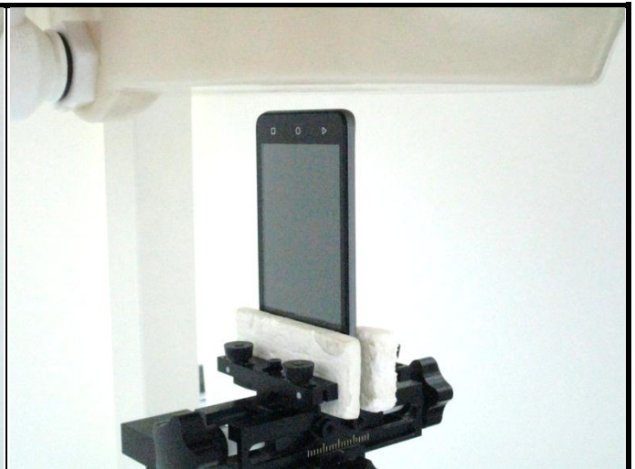
Bottom Side of EUT with 1.0 cm Gap