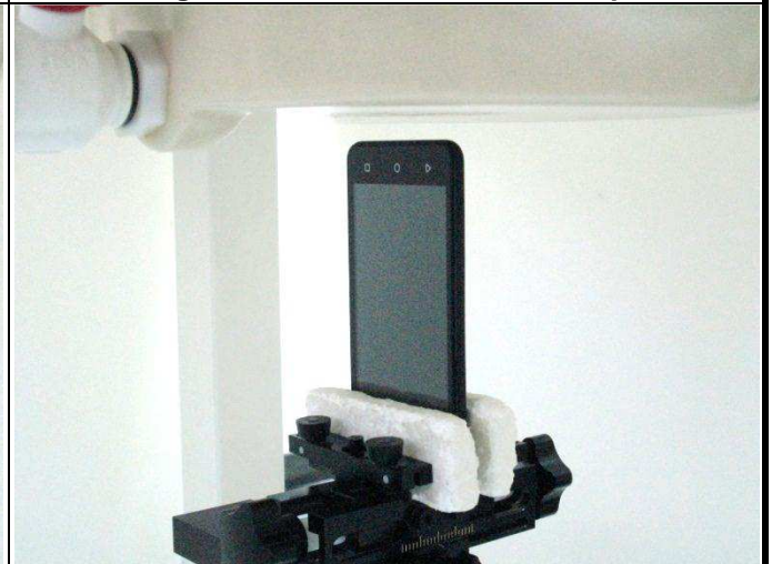
Bottom Side of EUT with 1.0 cm Gap