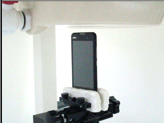
Top Side of EUT with 1.0 cm Gap