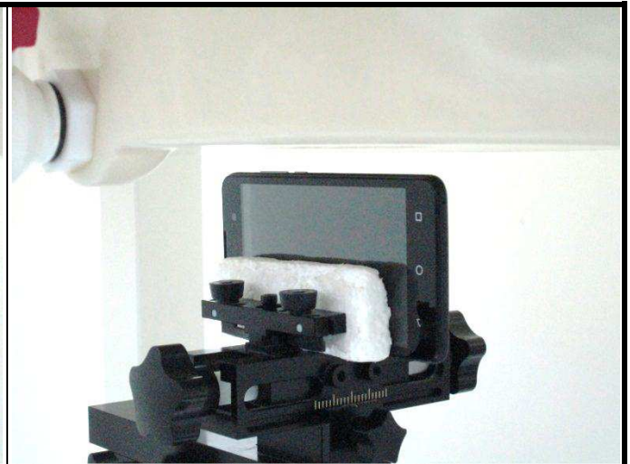
Right Side of EUT with 1.0 cm Gap