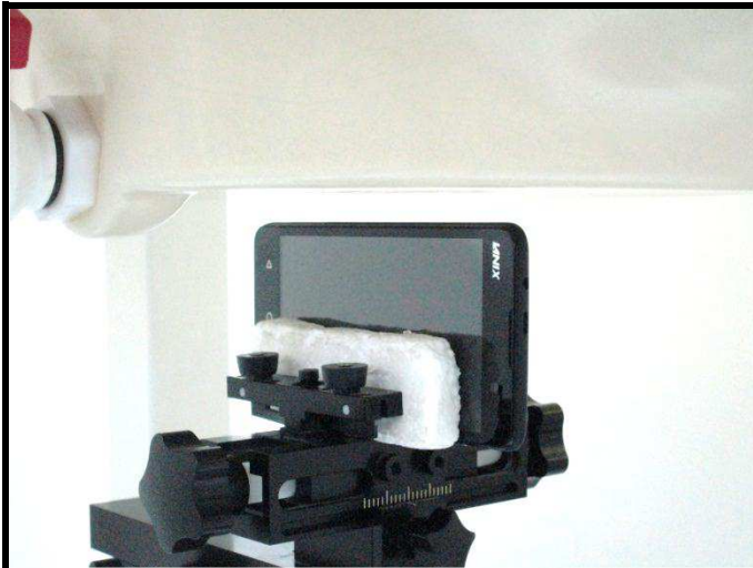
Left Side of EUT with 1.0 cm Gap