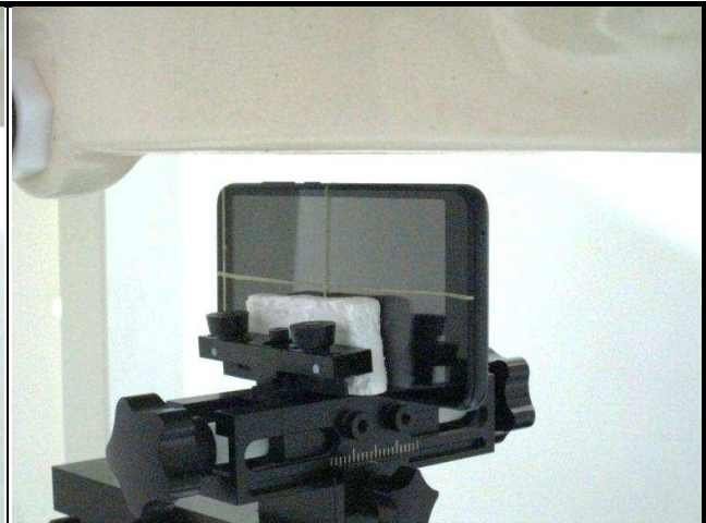
Right Side of EUT with 1.0 cm Gap