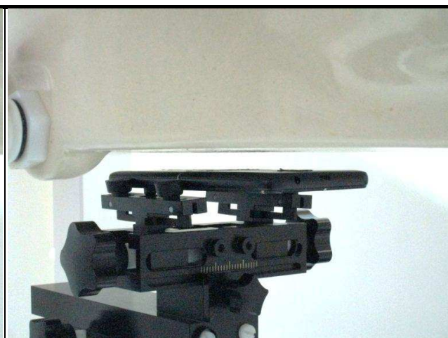
Rear Face of EUT with 1.0 cm Gap