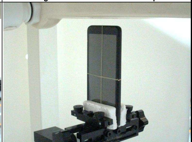
Bottom Side of EUT with 1.0 cm Gap