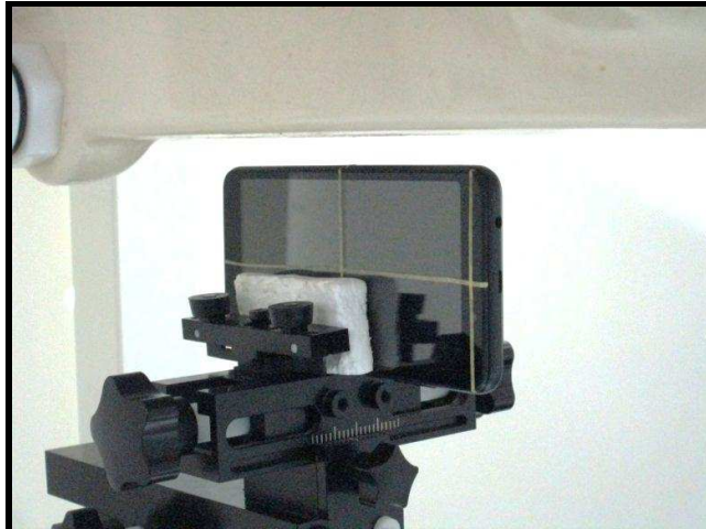
Left Side of EUT with 1.0 cm Gap