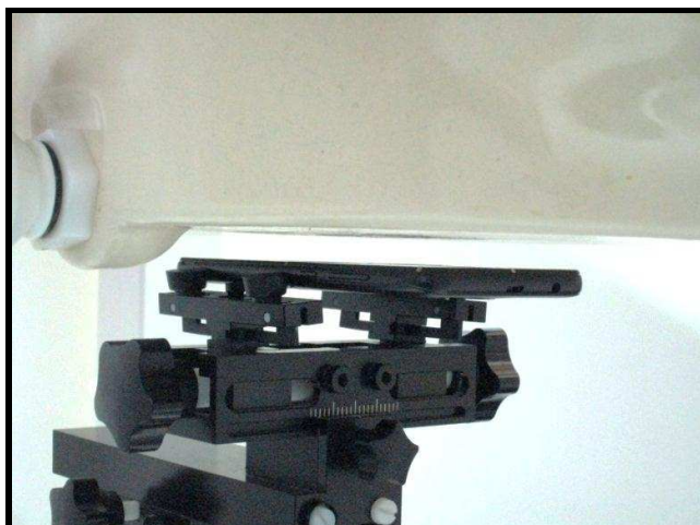
Front Face of EUT with 1.0 cm Gap