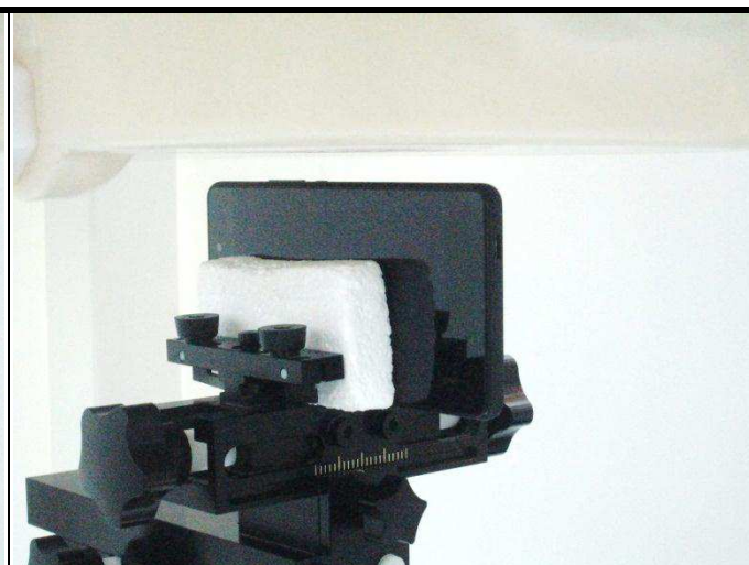
Right Side of EUT with 1.0 cm Gap