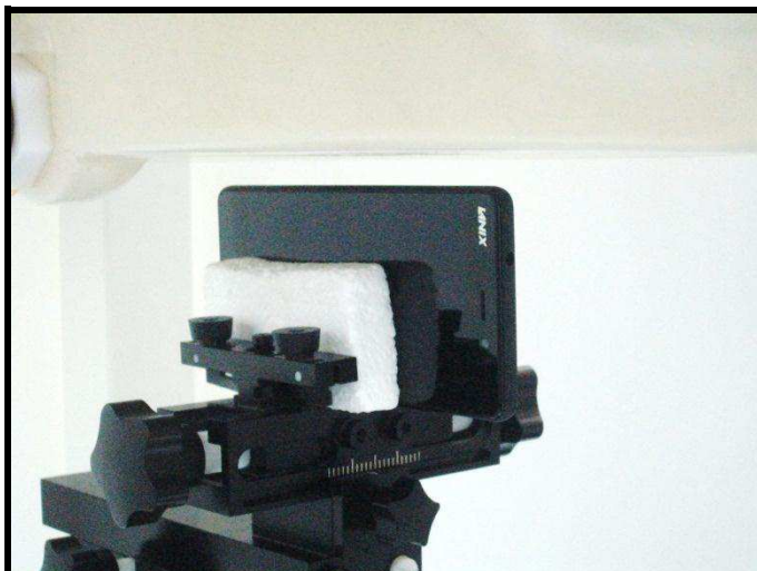
Left Side of EUT with 1.0 cm Gap