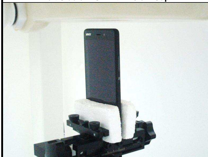
Top Side of EUT with 1.0 cm Gap