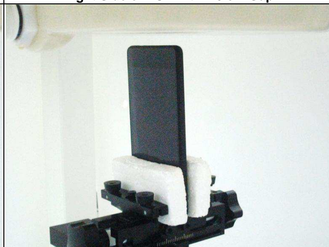
Bottom Side of EUT with 1.0 cm Gap