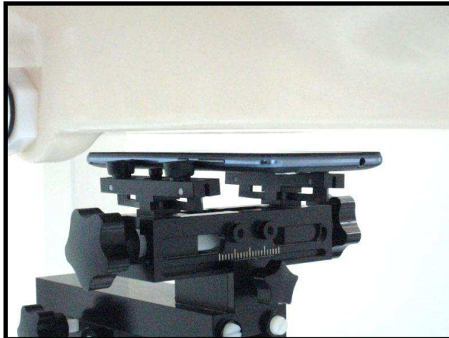
Front Face of EUT with 1.0 cm Gap