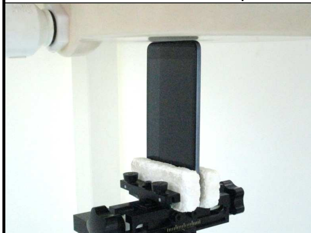
Bottom Side of EUT with 0 cm Gap