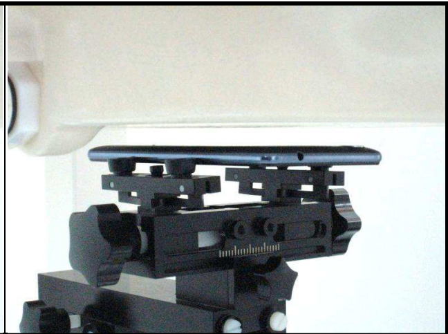
Rear Face of EUT with 1.0 cm Gap