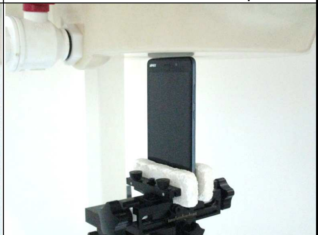
Top Side of EUT with 0 cm Gap