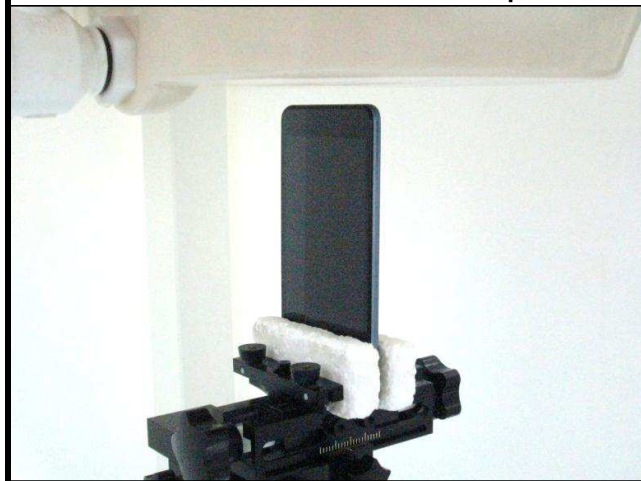
Bottom Side of EUT with 1.0 cm Gap