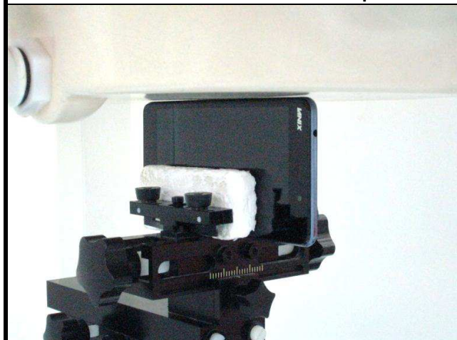
Left Side of EUT with 0 cm Gap