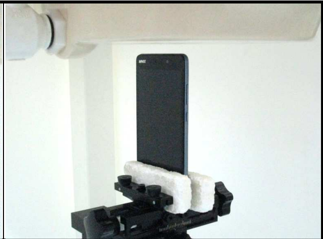
Top Side of EUT with 1.0 cm Gap