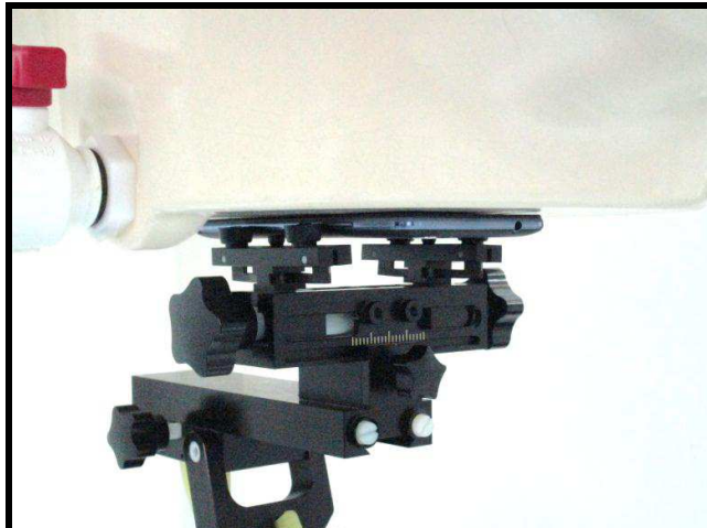
Front Face of EUT with 0 cm Gap