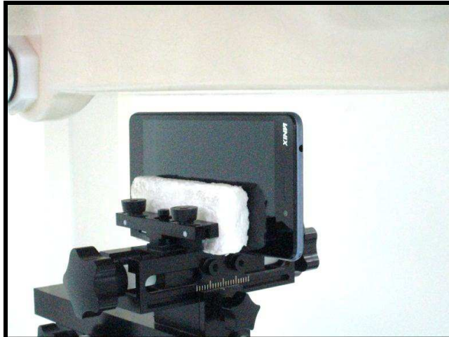
Left Side of EUT with 1.0 cm Gap