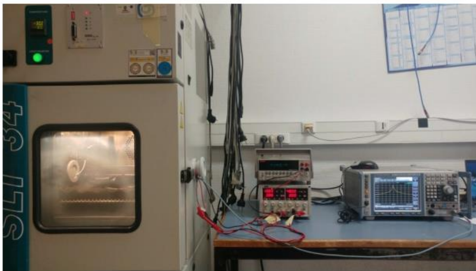
Photo of frequency tolerance in extreme test condition