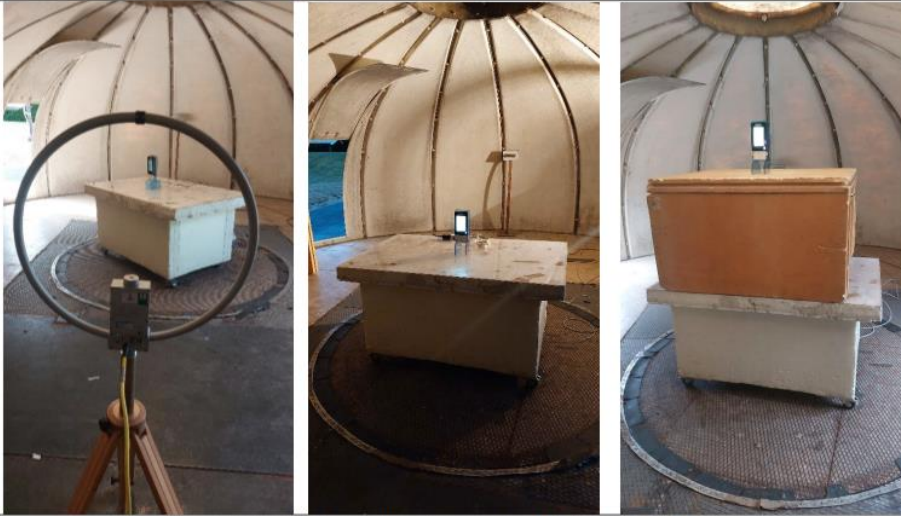
Photo of Field strength outside the band 13.110-14.010MHz