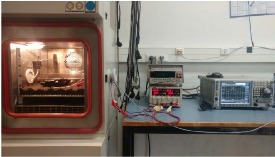
Photo of frequency tolerance in normal test condition