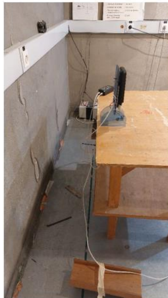
Photo of AC Power Line Conducted Emissions