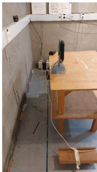
Photo of AC Power Line Conducted Emissions