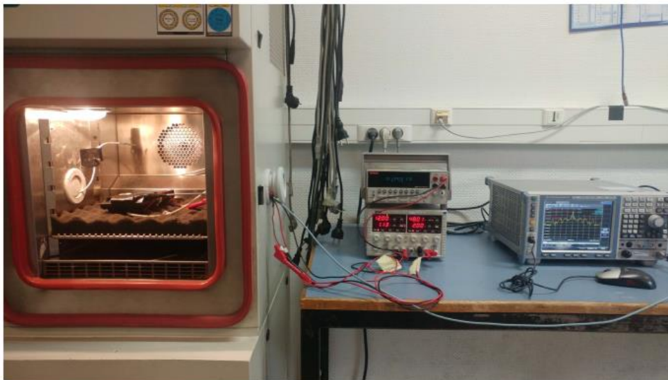
Photo of 20dB emission bandwidth