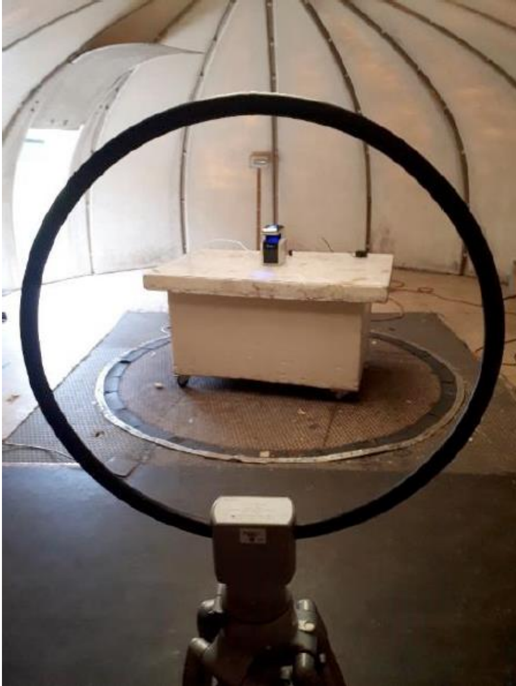
Photograph for Field strength within the band 13.110-14.010MHz