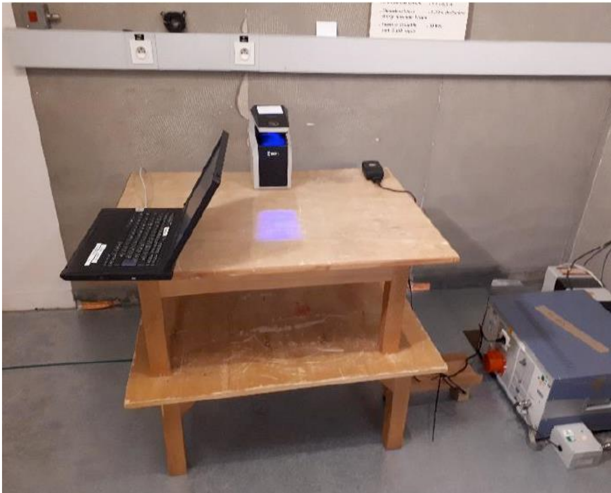
Photograph for AC Power Line Conducted Emissions (Front view)