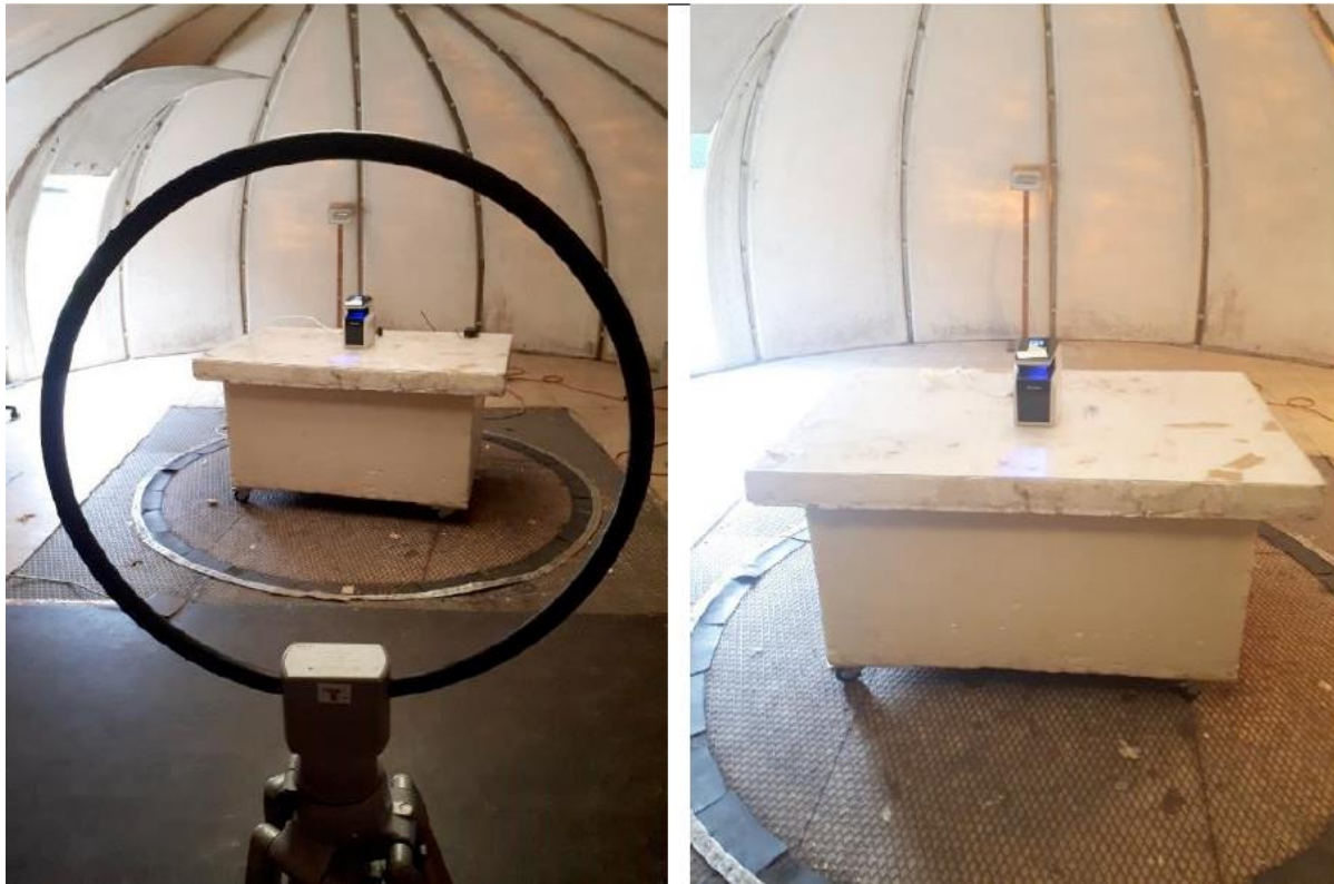
Photograph for Field strength outside of the bands 13.110-14.010 MHz