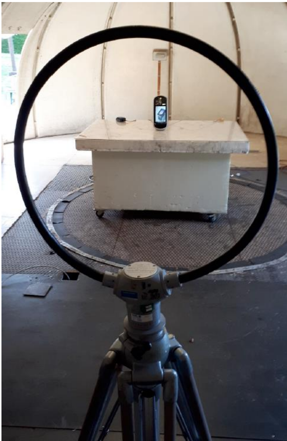
Photograph for Field strength within the band 13.110-14.010MHz