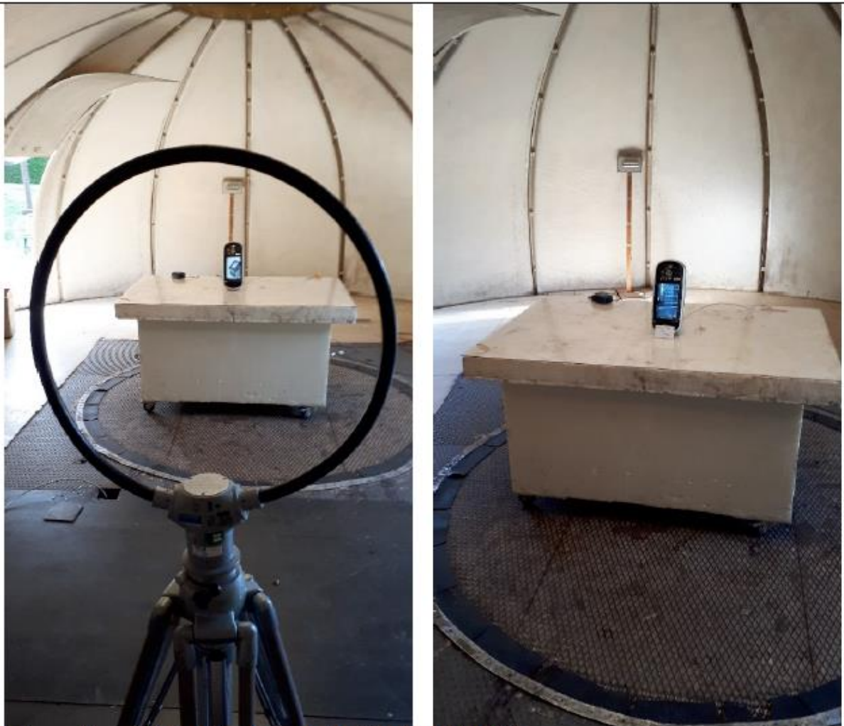
Photograph for Field strength outside of the bands 13.110-14.010 MHz