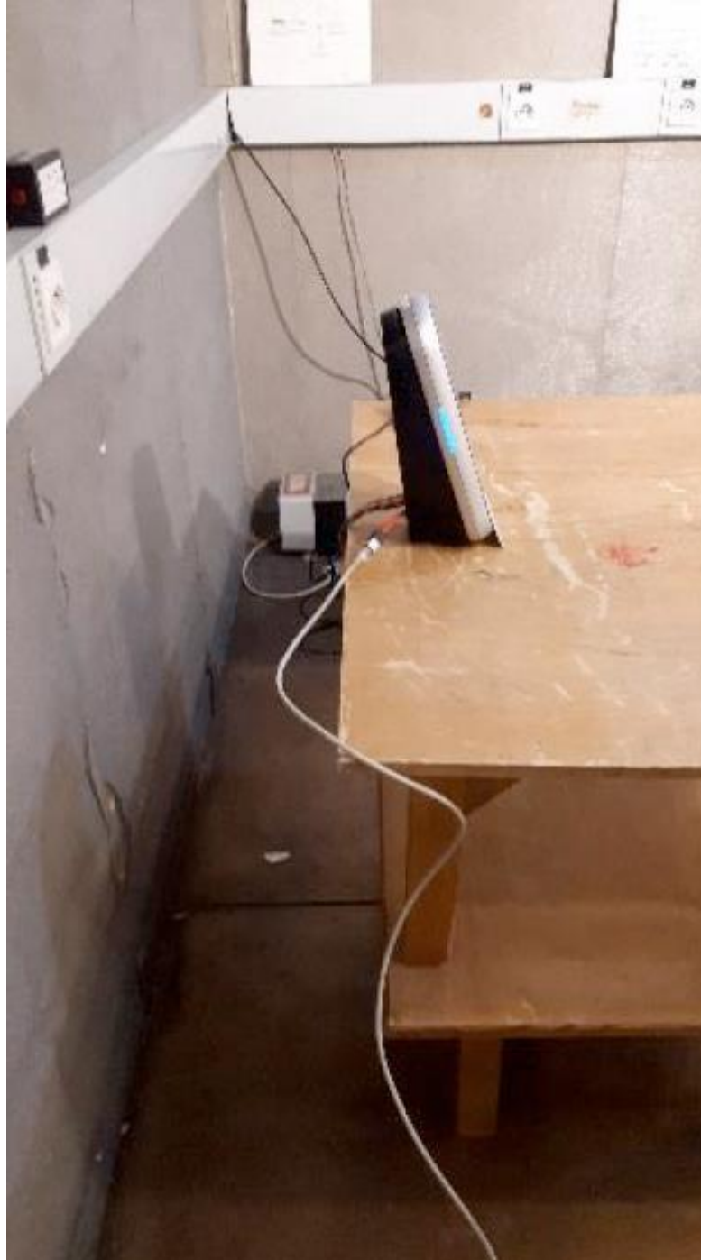
Photograph for AC Power Line Conducted Emissions (Rear view)