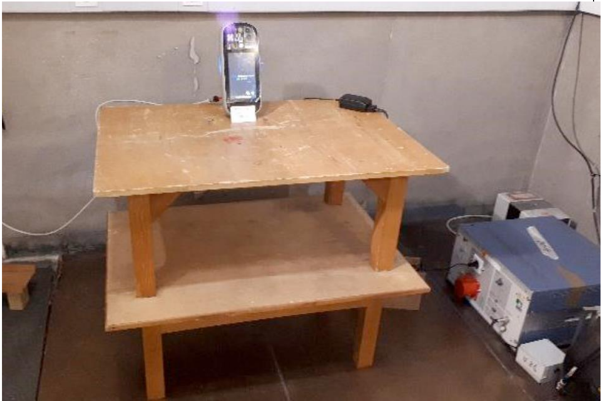
Photograph for AC Power Line Conducted Emissions (Front view)