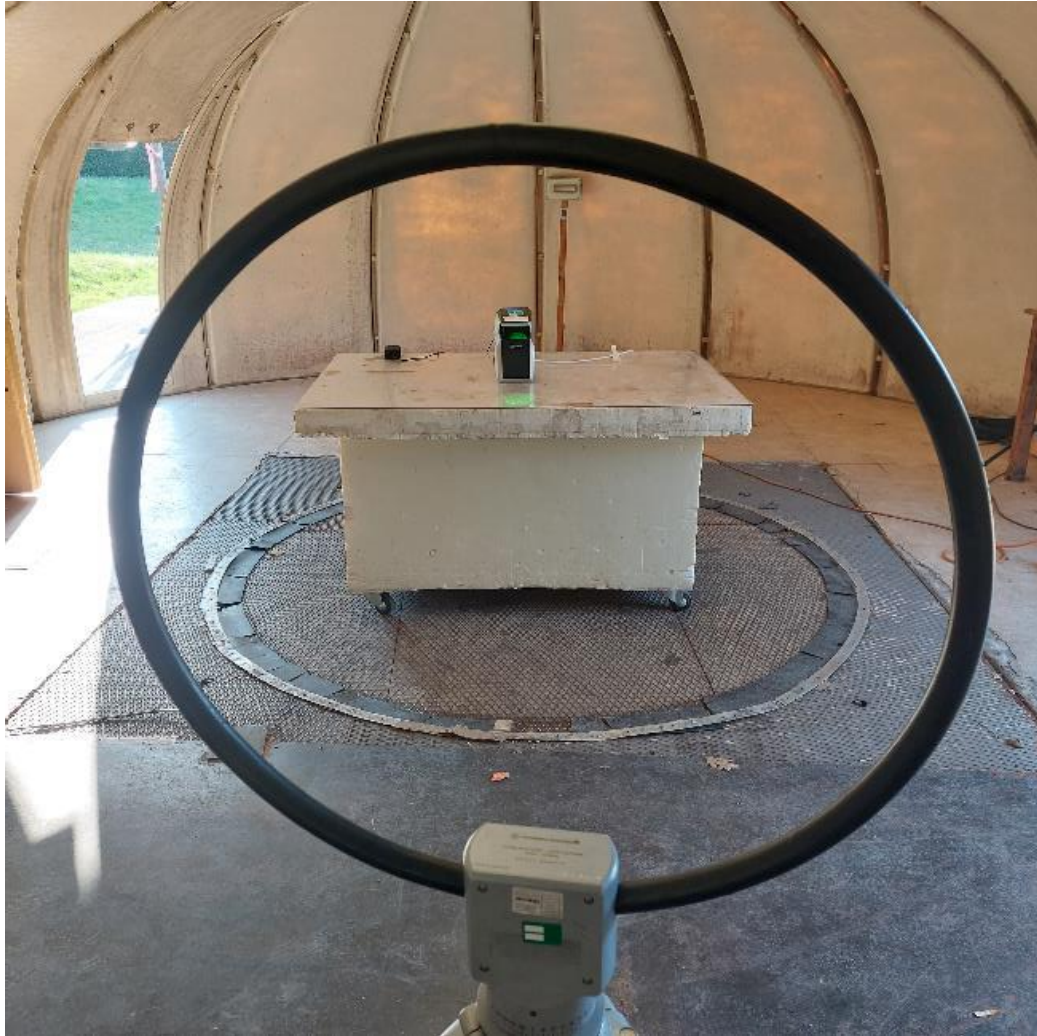
Photograph for Field strength outside of the bands 13.110-14.010 MHz