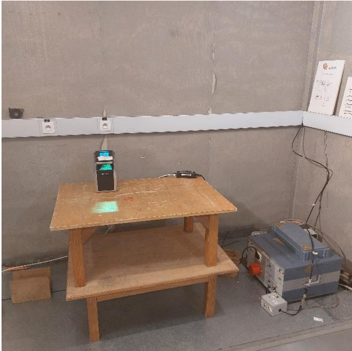
Photograph for AC Power Line Conducted Emissions (Front view)