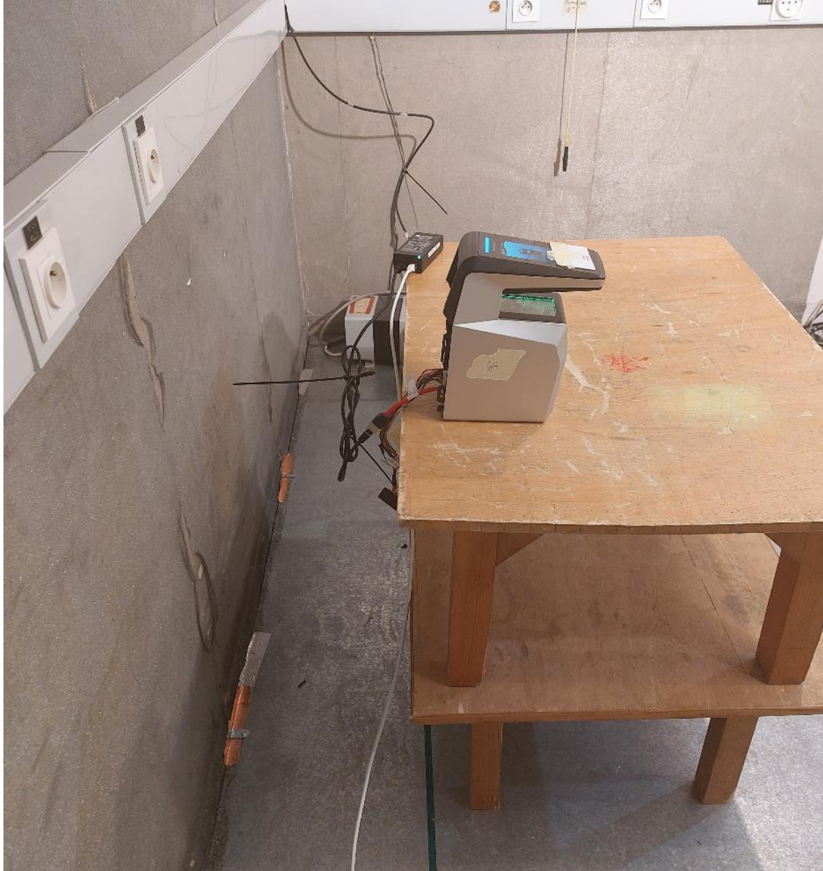
Photograph for AC Power Line Conducted Emissions (Rear view)