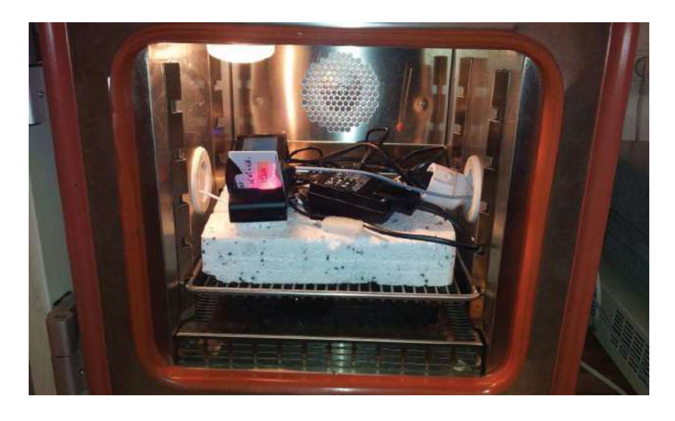
Photograph for Occupied Bandwidth