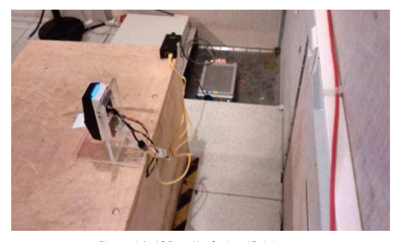
Photograph for AC Power Line Conducted Emissions