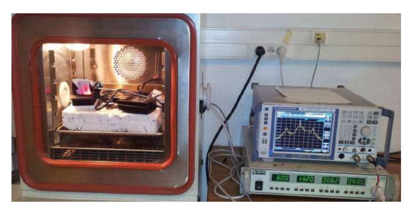
Photograph for Frequency tolerance in normal and extreme test condition