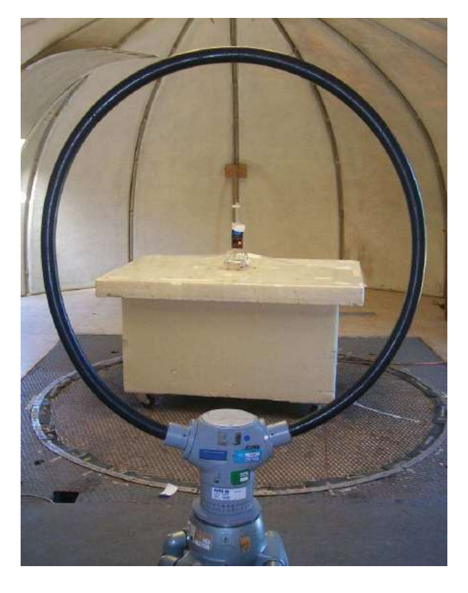
Photograph for Field strength