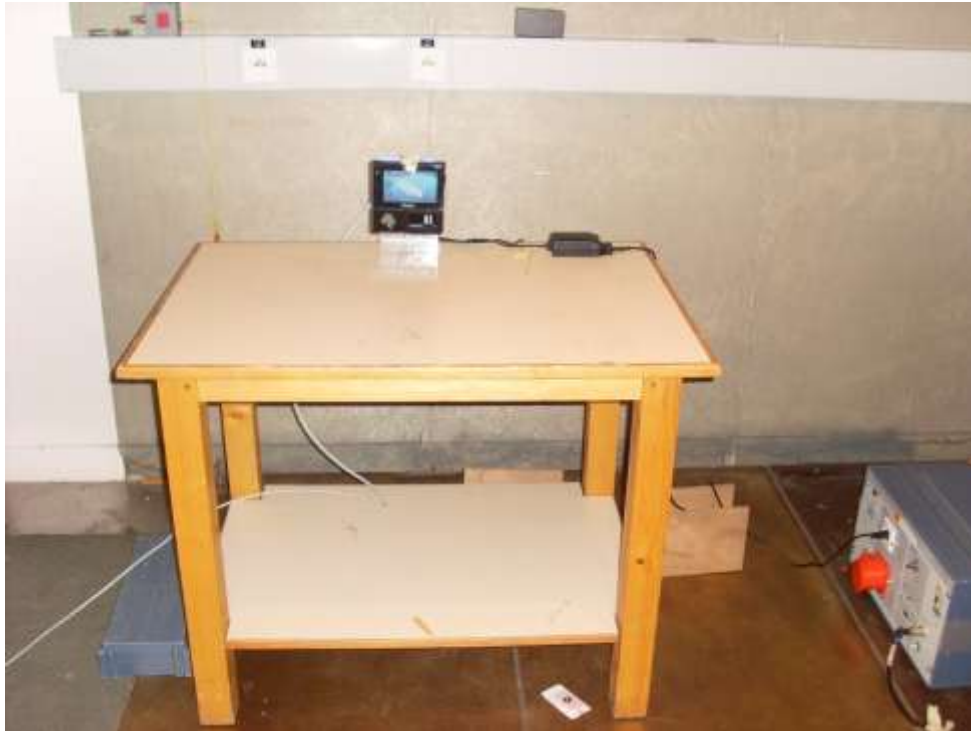
Test setup for power line conducted emissions (AC/DC power supply)