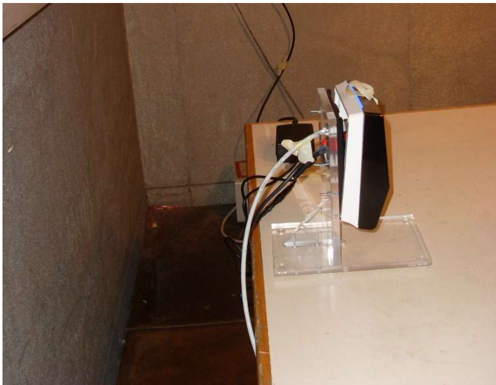
Test setup for power line conducted emissions (AC/DC power supply)