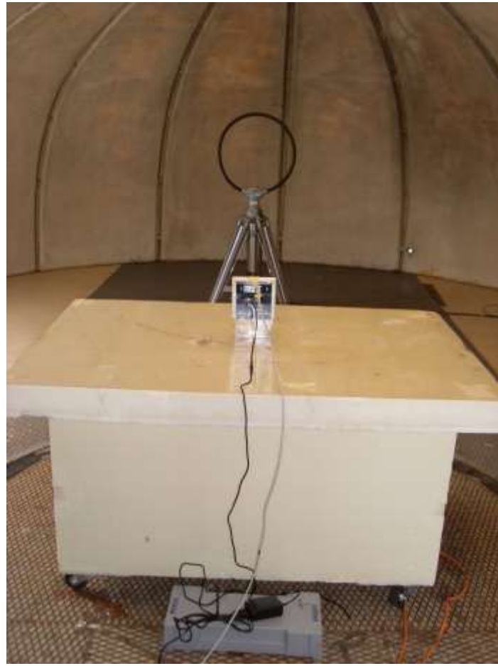
Test setup for radiated field strength