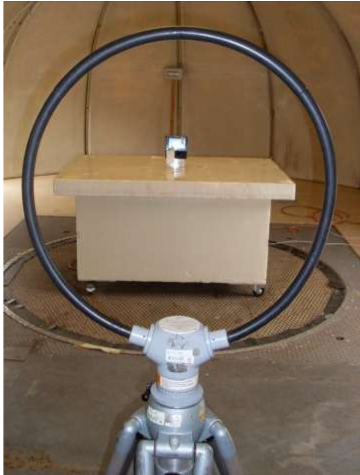
Test setup for radiated field strength