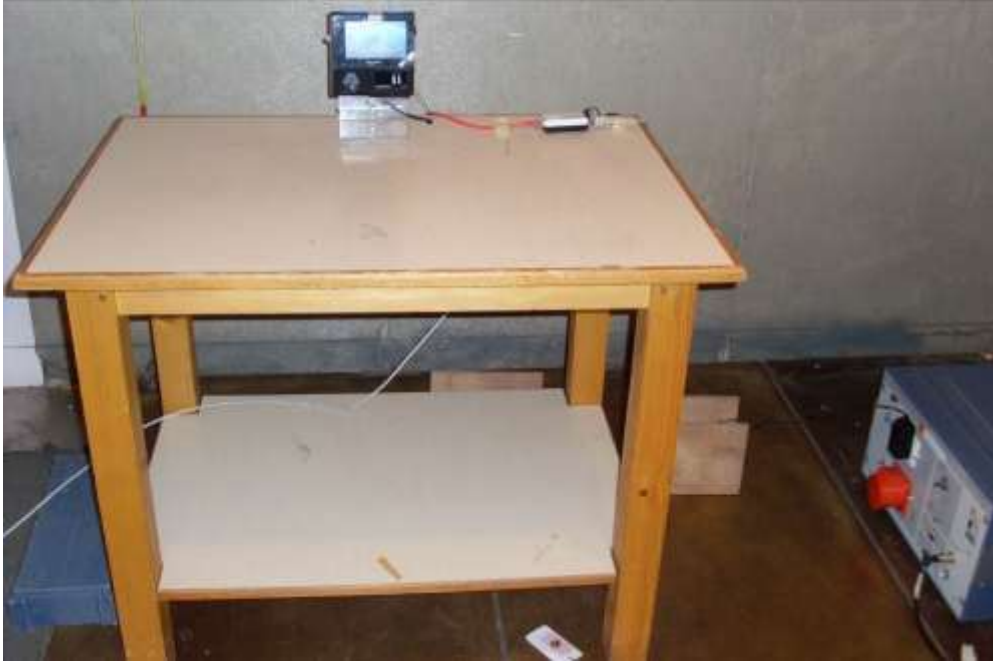
Test setup for power line conducted emissions (POE adaptor)