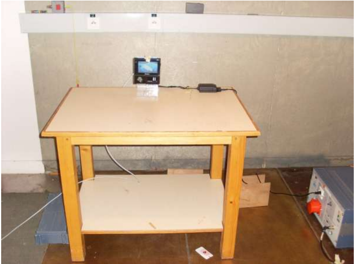
Test setup for power line conducted emissions (AC/DC power supply)