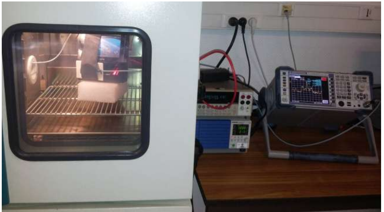
Test setup for frequency stability measurement in extreme conditions