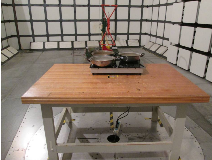
Radiated Emissions - Rear View (30 MHz-1GHz)