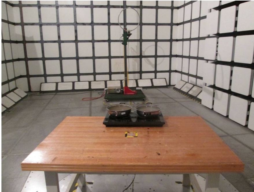
Radiated Emissions - Rear View (90 kHz-30 MHz)