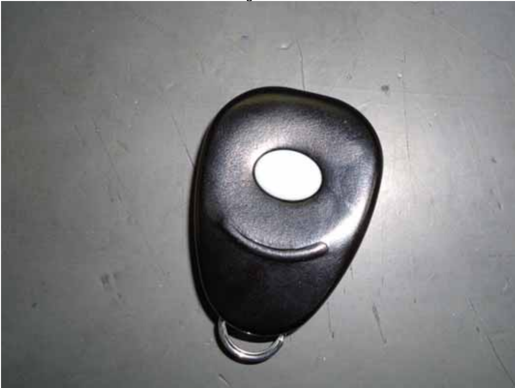
Test Item Setup