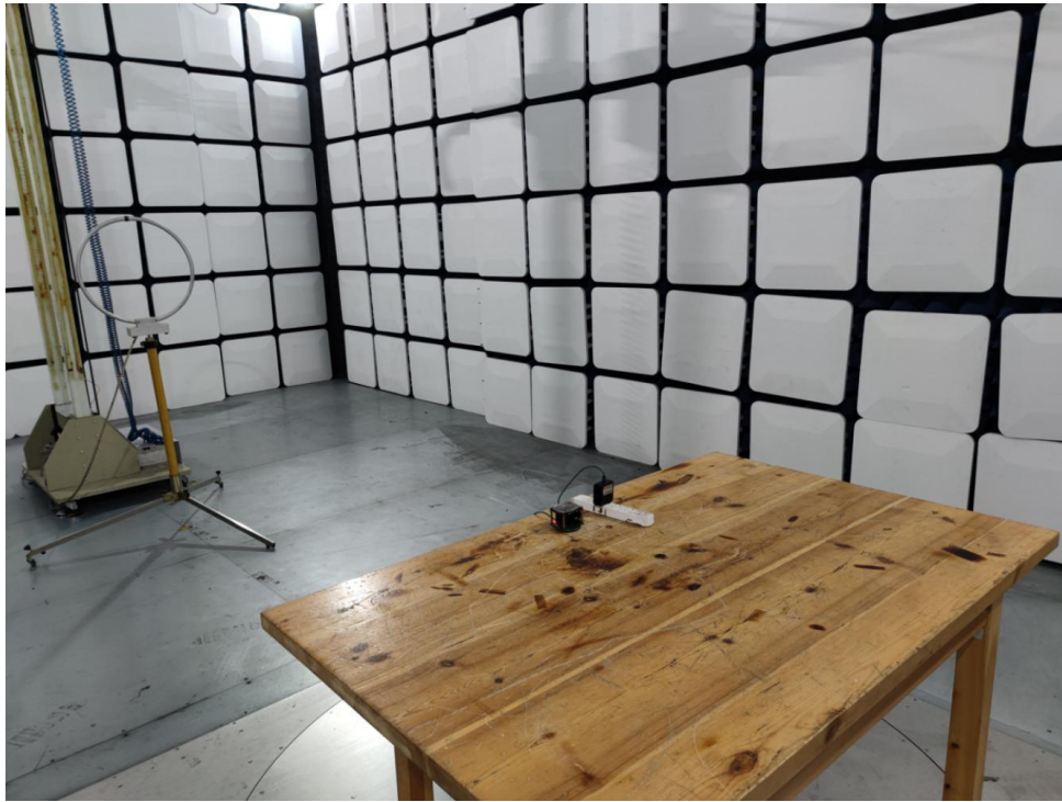
Photo of MPE Measurement