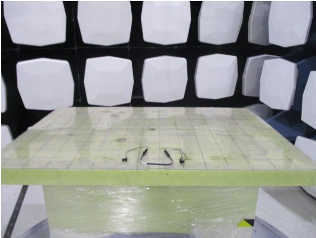
Below 1GHz (The EUT placed at the center of turntable)