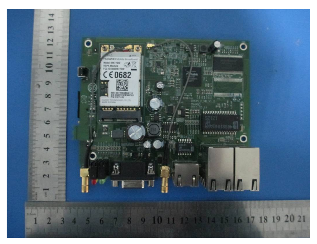
Main Board Front View