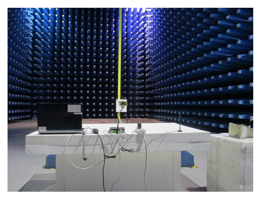
Radiated Emissions Test Setup Above 1GHz - Front View