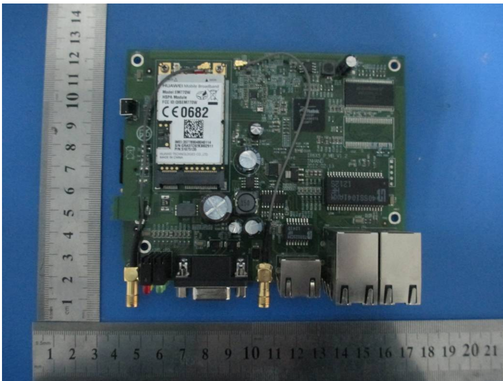
Main Board Front View