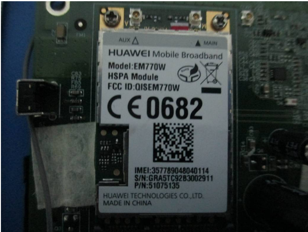
3GModule View for IR615WH01