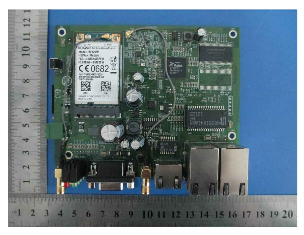
Main Board Front View