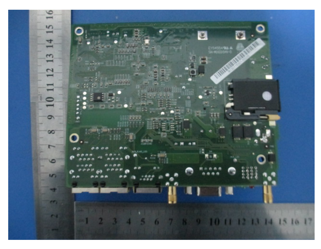
Main Board Rear View

Report No: 13020108-2-FCC-E1-V1 Issue Date: March 20, 2013 Page: 25 of 33