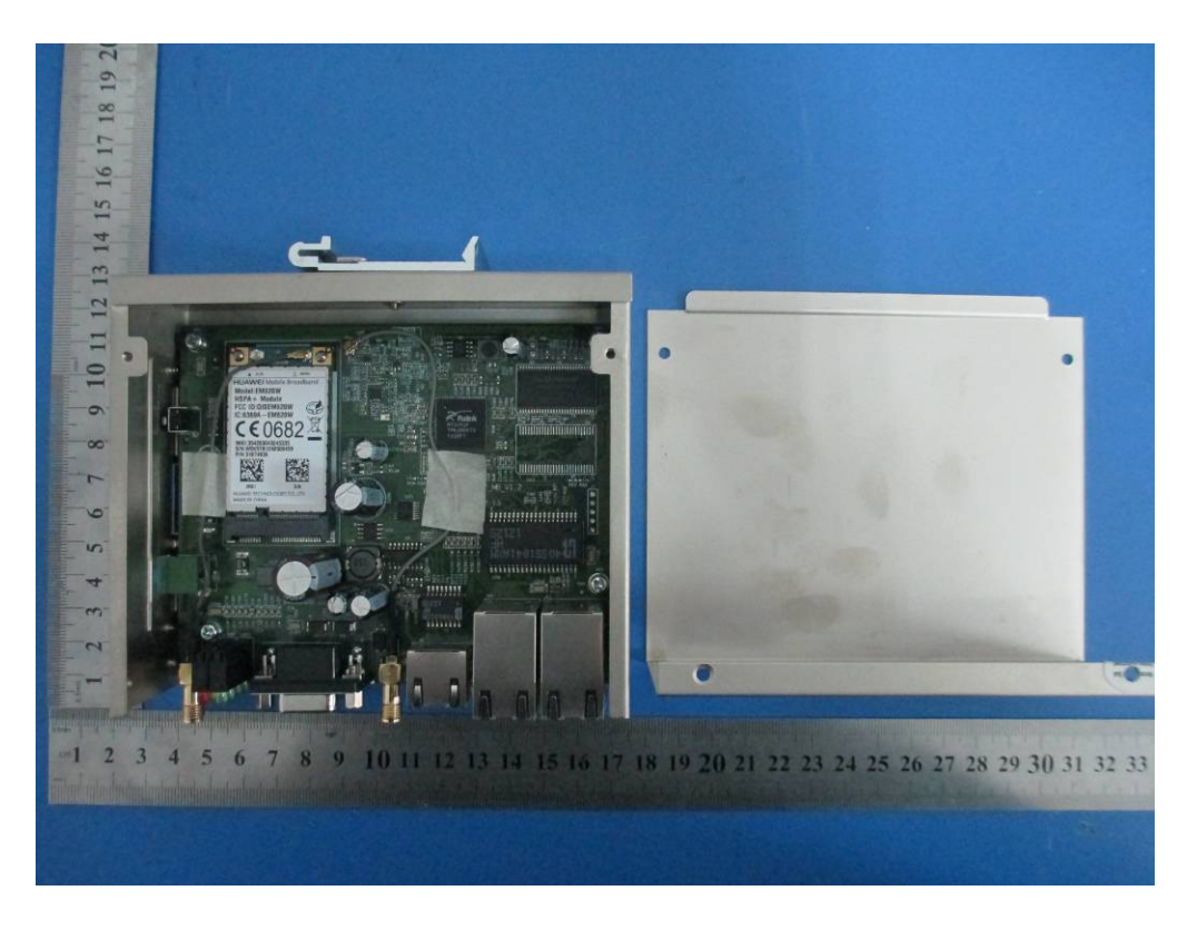
Cover Off - Front View