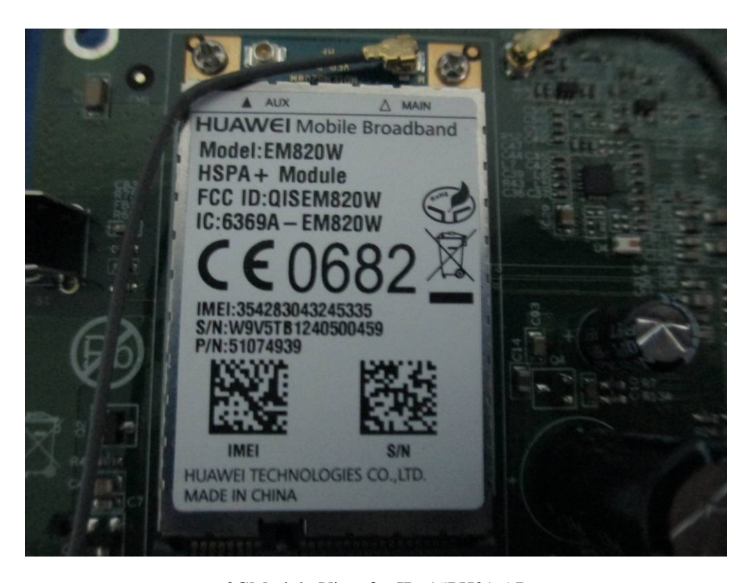
3GModule View for IR615PH01-AP

Report No: 13020108-2-FCC-E1-V1 Issue Date: March 20, 2013 Page: 24 of 33